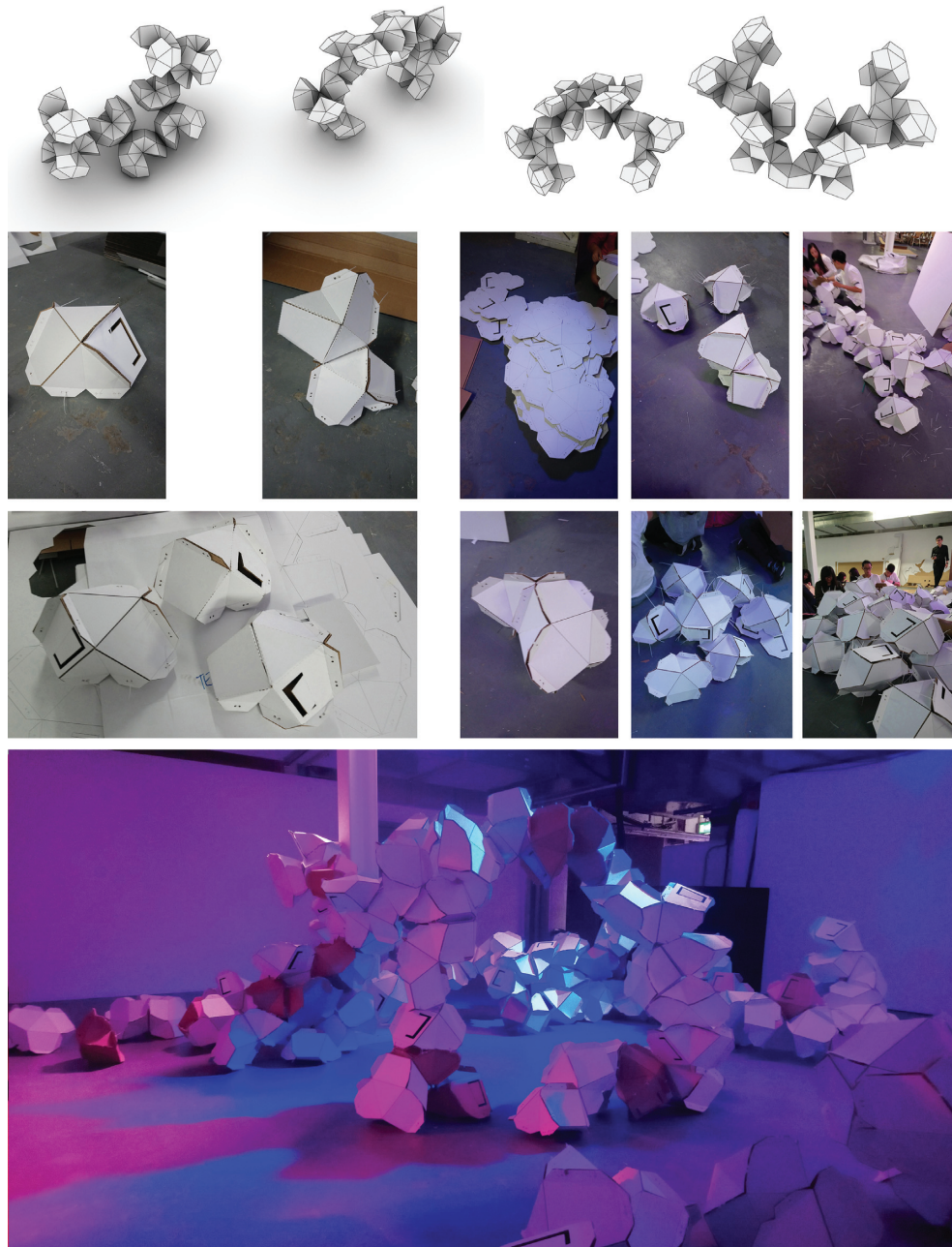
FIGURE 1: The Fish Trap installation consisting of predefined precut components. The intervention was built on-site based on improvisation and collaborative design strategies. The possible spatial scenarios had been simulated computationally using stochastic aggregation strategies. The designer designed the building block only, which allows builders to build an endless variety of outcomes.

In the current common form of construction, the general construction module usually uses the “Fragment Geometry” to construct the fragmented unit to a huge entirety, and finally groups the main type together to challenge a structural form [14], but a bolder approach in the thinking of The Orchid Pavilion design was taken. A large area and efficient structural unit modulus were expected to be completed. At the same time, a different functional form through cutting and fine-tuning was made in order to achieve an efficient structure. Considering the construction method, this approach still maintains the logical thinking of building of basic units of the