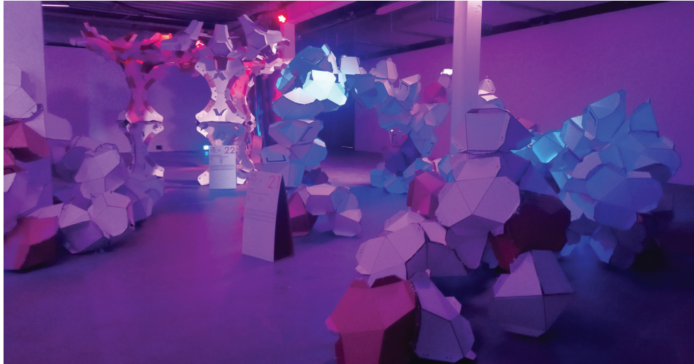
FIGURE 3: Two proto-architectural interventions built on-site based on collaborative design strategies: top-down design process and bottom-up on-site interventions.

work and sharing the ideas, and knowledge acquired during and after the process. This may inform their further personal training in the discipline of architecture. Moreover, such a pedagogical strategy could be applied in educational processes more frequently in order to articulate hands-on working within the context of digital technologies, following the idea of spontaneity, participation, and predefined kits-of-parts component design and preparation. This strategy can be applied in all levels of learning in a vertical manner (lower level students can work with more experienced students and learn from them). The students participating in these two studies were undergraduate students. A model of learning through making will yield better-oriented experts in the discipline, capable to solve any particular problems more efficiently.