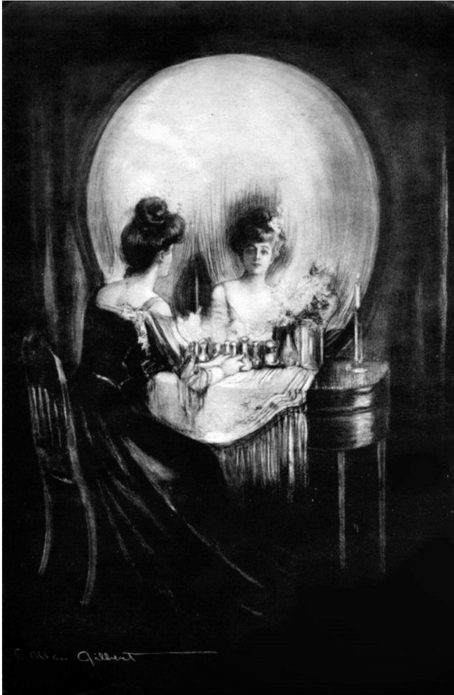
Allan Gilbert, All is Vanity

Retrieved from https://commons.wikimedia.org/wiki/File:Allisvanity.jpg