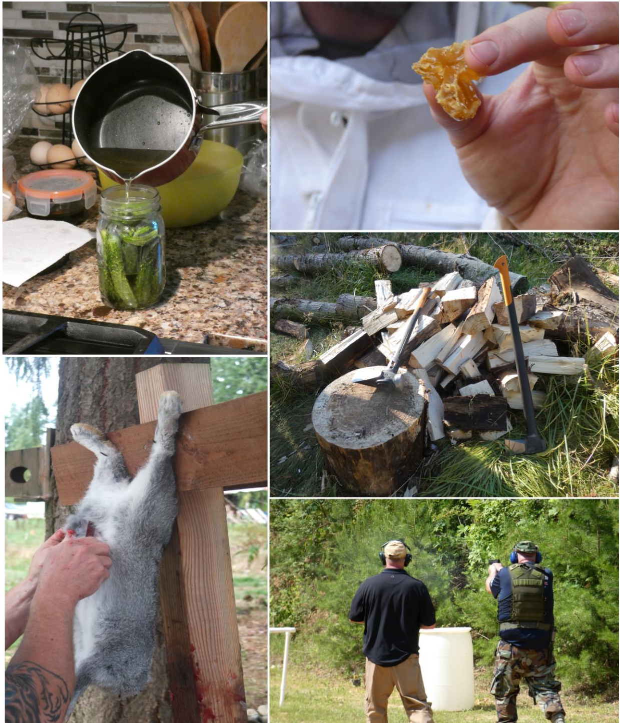
Figure 2 Experiences Enabled by Storytelling (clockwise from top left): Pressure-canning pickles; fresh honey reaped from bee-keeping; chopping wood; fire-arms training; and butchering rabbits.