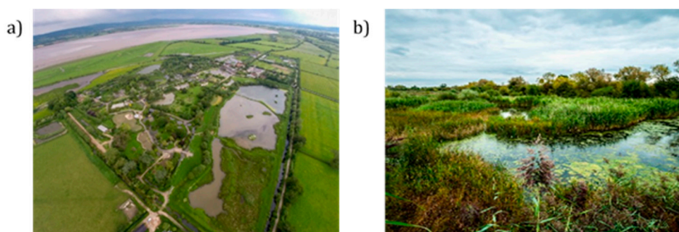
Figure 1. (a) The wetland nature-based health intervention took place within a Wildfowl & Wetlands Trust (WWT) wetland site in Gloucestershire, UK. (b) The site allows visitors to interact with wetland nature in multiple ways, including canoeing through reed beds.

On site, there are numerous bird hides that provide visitors with views of charismatic wildlife (e.g., Eurasian cranes, Grus grus and kingfishers, Alcedo atthis ). In addition to bird watching, visitors can take part in a range of activities, such as canoeing and guided walks. The wetland NBI was designed to draw on these opportunities for interaction with nature (Figure 2). Each week participants were transported via minibus to the site from surrounding areas, so they could engage in structured activities, which were guided by a minimum of two wetland site staff members and one trained mental health support worker.