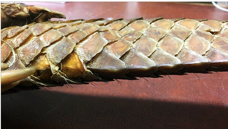
Fig. 1. Photograph of Sunda pangolin tail section (pictured laterally) showing scale beds where scales used to be present.

The number of scales per species ranged from 382 \pm 31.87 (mean \pm SD; n = 6 ) in Temminck's ground pangolin to 940 \pm 76.18 (SD; n = 3 ) in the Philippine pangolin. Mean number of scales across all species was 649.4 \pm 178.97 (SD; n = 66 ) (Table 1: Fig. 2). Intra-species variation in number of scales was observed in all sampled groups (Fig. 2). Specimens of giant pangolins varied the most, ranging between 509 and 664 scales ( 574.4 \pm 60.54 , n = 8 ); specimens of Chinese pangolins varied