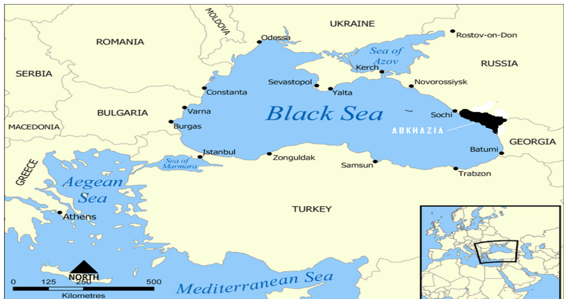
Figure 3. Maps showing the geographical location of Abkhazia within the Black Sea, Mediterranean and Eurasian areas.

(the primus inter pares of the nine eastern Orthodox patriarchates). The schism is not theological or based on other religious difference but reflects state contentions between Abkhazia and Georgia, an opposition to the Georgian Orthodox Church hierarchy, one of whose leaders, the hieromonk (priestmonk of the Orthodox Church) Father Giorgi (Basiladze) put the Georgian Church's view as: "We will certainly return to Abkhazia, whether or not the Abkhaz, Russians or whoever else want this or not. We will return independently of whether our Abkhaz brothers come to their senses or harden their hearts even more against us" (Giorgi 2009).