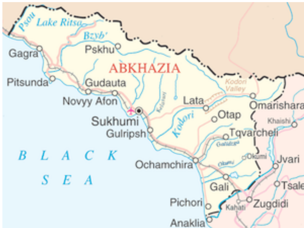
Figure 1. Abkhazia

The country is today going through great social changes brought about by the destruction of the Soviet Union, wars and demographic shifts that are depopulating the villages. Most urbanites still retain the village ancestral house and land, and the link between town and village continues. This affects their adaptation to living for long periods in towns, alongside the breakdown and porosity of the boundaries of closed village communities and geographical dispersal of lineages.