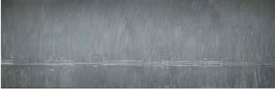
2 Cy Twombly: Treatise on the Veil II , 1970