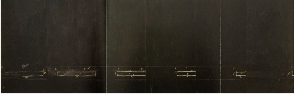
1 Cy Twombly: Treatise on the Veil , 1968

in particular, the photographs of Eadweard Muybridge, I illuminate how he uses grey to place painting at the interface with other media – for my concerns, photography and cinema, but also music and writing. 6