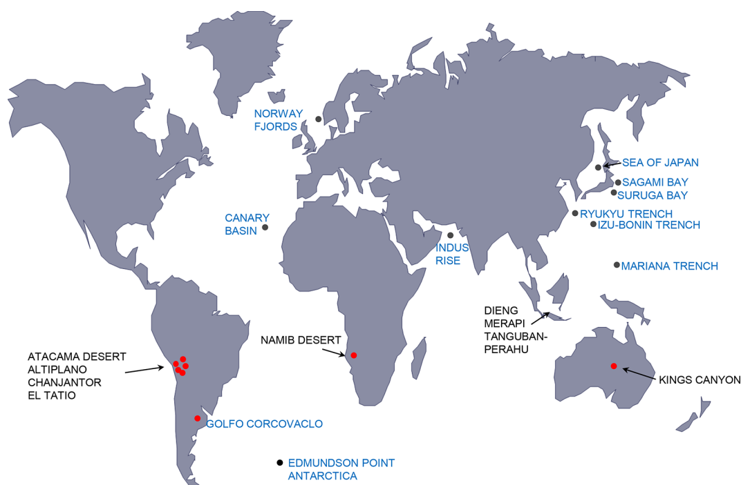
Fig. 1. Global distribution of extremobiosphere sites sampled during 1992–2017.

Our bioprospecting campaigns have targeted major extreme biomes and within them distinct sites displaying various degrees of environmental extremities. Thus, the choice of deep sea and desert biomes provides strong selective pressures, for example in hyperbaric pressure and aridity respectively, that determine the composition of their actinobacterial communities. Fig. 1 shows the global distribution of extreme biome sampling sites that we have researched and which, in addition to the principal focus on deep seas and deserts, also has included polar, thermal and volcanic environments. Specific details of these sites are given in Table 1, where the range of altitude over which our 'bioprospecting campaigns'