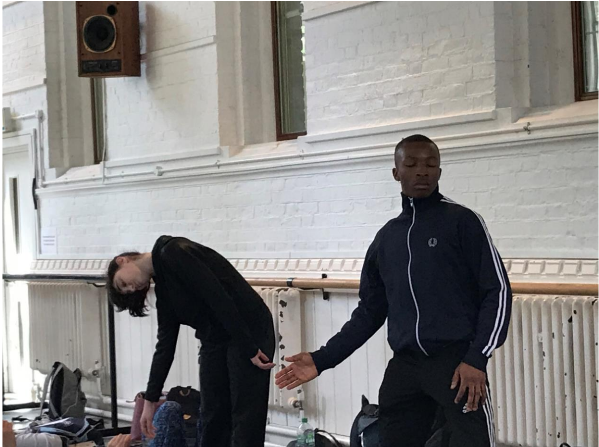
Figure 2 Eyes closed