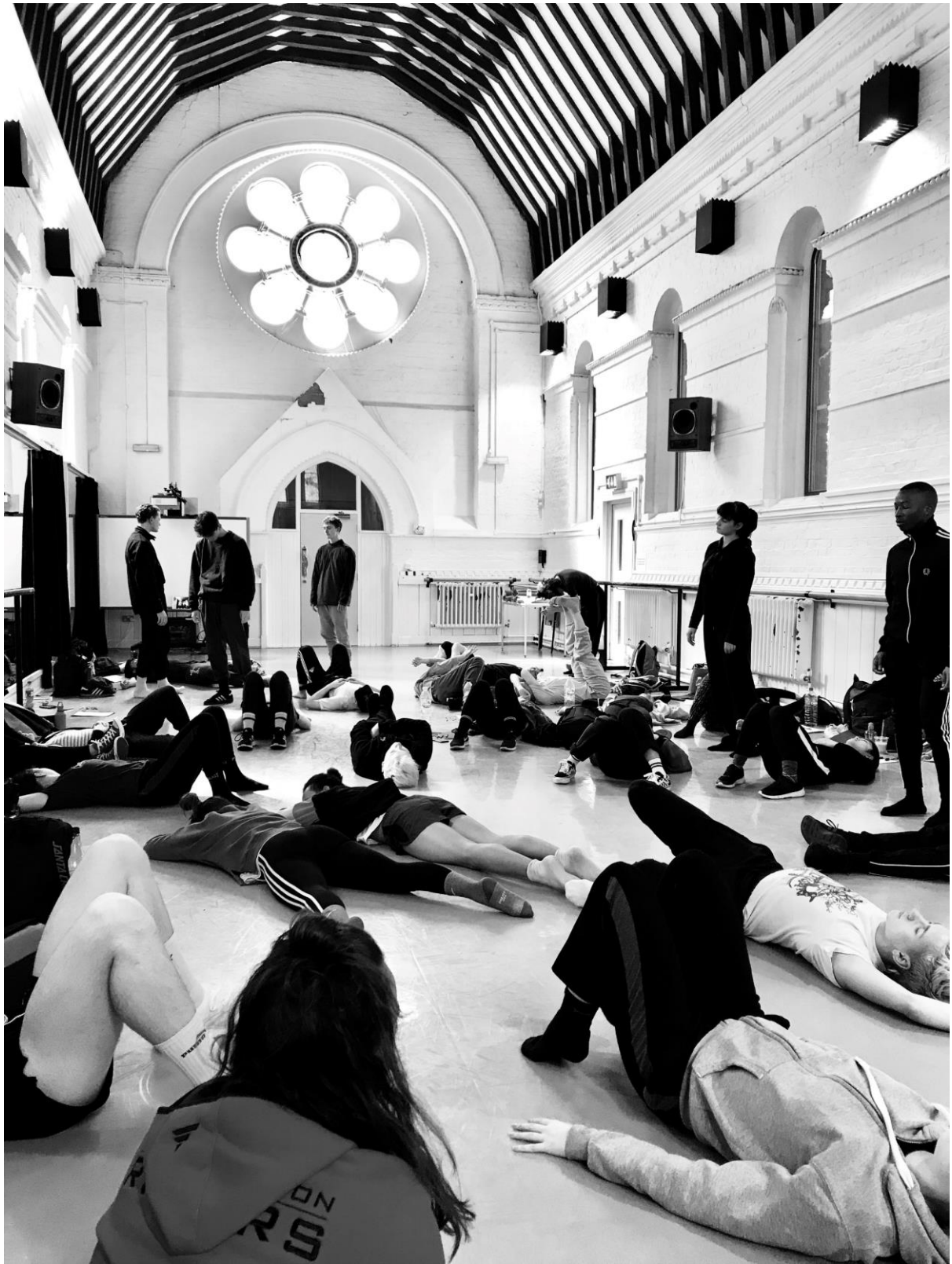
Figure 3 Movers in the chapel studio

The dancers in this experimental project were in their second year of undergraduate study, and though they had had a large reflective component throughout their first year and had a