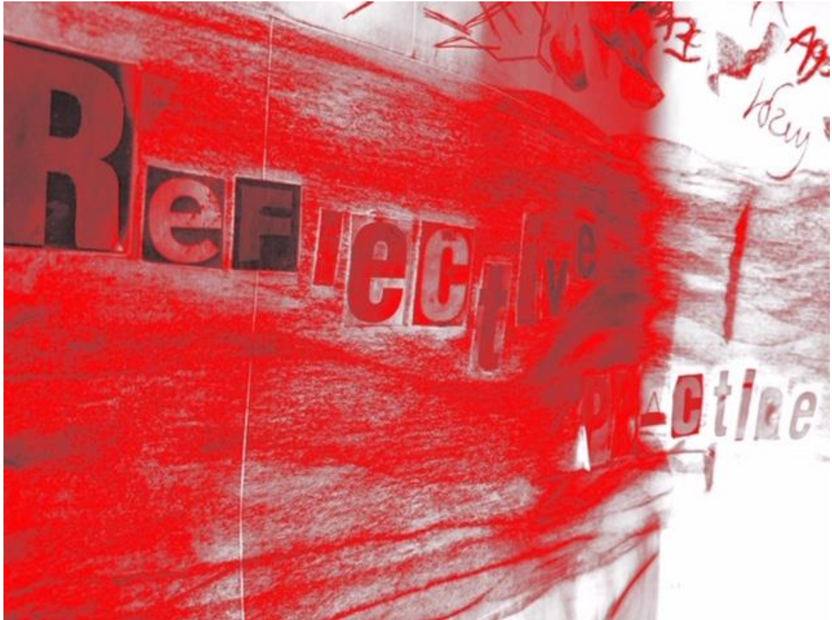
Figure 1 Reflective practice