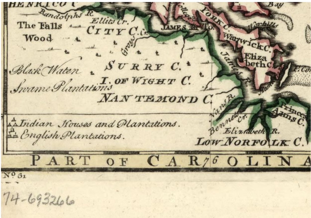
Detail: The legend and key for plantations from Emanuel Bowen, New and Accurate Map of Virginia and Maryland . See Map 6 in Appendix for full image.