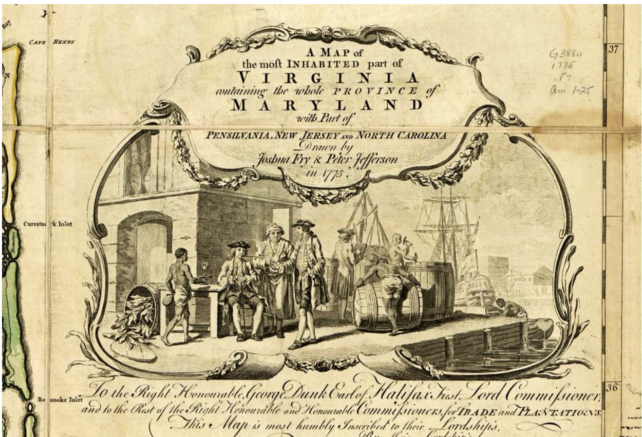
Detail: Cross section of the title image from Joshua Fry, A map of the most inhabited part of Virginia containing the whole province of Maryland with part of Pensylvania, New Jersey and North Carolina . See Map 1 in Appendix for full image.