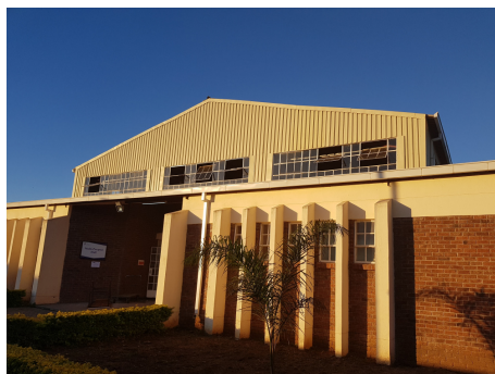
Figure 1: Harare Institute of Technology: the venue for the pilot LabHack event in Zimbabwe