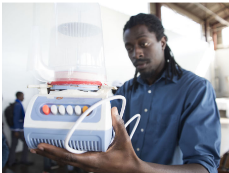
Figure 8: The team that won the prize for most frugal design built a centrifuge from a food mixer.