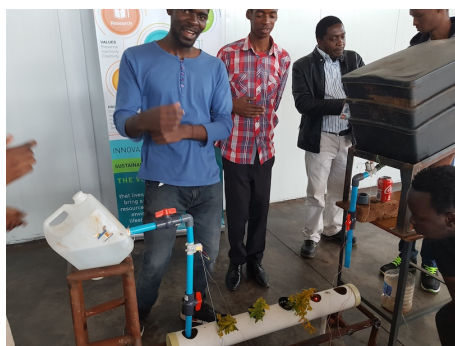
Figure 4: A team presenting their prototype hydroponics and vermiculture infusion instrument at the LabHack