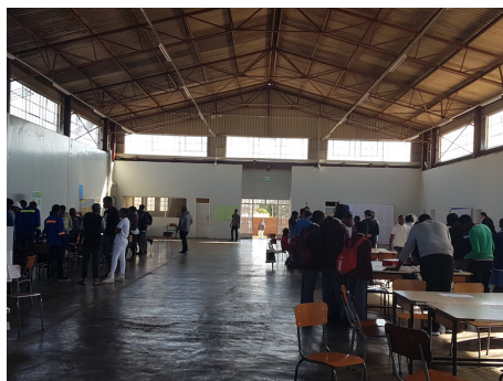
Figure 2: Inside the hall used for equipment demonstrations during the pilot LabHack event