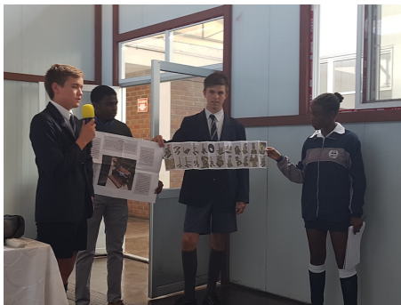
Figure 6: Participants present and describe their work

to build their own versions of the equipment. The LabHack therefore aims to foster both immediate and long term impact. It serves as an educational and motivational opportunity for participating students, who are encouraged to learn about the design and building of laboratory equipment, work collaboratively and apply creative thinking to their challenge. It also seeks to empower students and educators to address equipment shortages in learning environments, increase awareness of the Open Hardware movement and facilitate the cooperative sharing of designs and ideas. We envisage the LabHack as an ongoing and self-sustaining process to be applied whenever there is some equipment need, hence its representation in Figure 5 as a cycle.