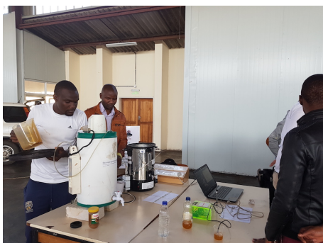
Figure 10: A team presenting their prototype bioreactor

designs. The longer creation phase also offers an extended learning period during which participants can develop the skills necessary for building their prototypes. Furthermore, it means that design documents can be submitted in advance of the event providing judges with more time to assess the teams. Finally, less time is required for prototype creation during the event meaning that much of the schedule can be dedicated to learning sessions. To assist with prototype creation, each team was provided with an Arduino kit. We also encouraged participants to visit our website, where we provided links to various support sources on Open Hardware, Raspberry Pi/Arduino projects and more.