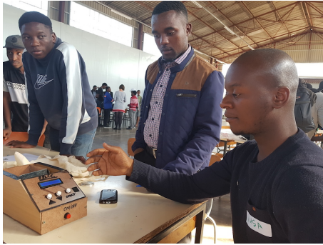
Figure 7: A participant demonstrates his team's PCR machine. This team won the prize for best documentation