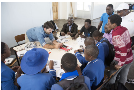
Figure 9: Participants take part in a session on building a $10 microscope. The session was run by event collaborator Andre Maia Chagas.