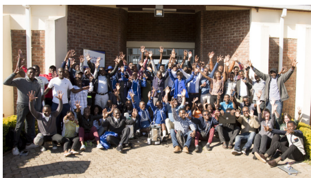
Figure 12: LabHack Zimbabwe 2018 group photo.