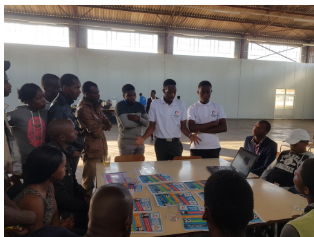
Figure 3: At the LabHack, participants join a workshop session on using an Arduino, which was run by a local start-up company

Within Africa, hackathons enable members of the public to engage with technology. There have been hackathons on social issues such as the developing sustainable bioinformatics capacity [2], as well as topics including cybersecurity [5]. As hackathons have grown in popularity in Africa, so too has the Open Hardware movement. The Africa Open Science and Hardware Summit [1], which aims to create a community of individuals from across society interested in Open Science and Hardware, is a good example of this. There has also been research in this area examining the challenges researchers face and more broadly, the accessibility of scientific research in Africa [3]. Our work takes a novel approach in combining these two fields in order to address real-world sociotechnical issues.