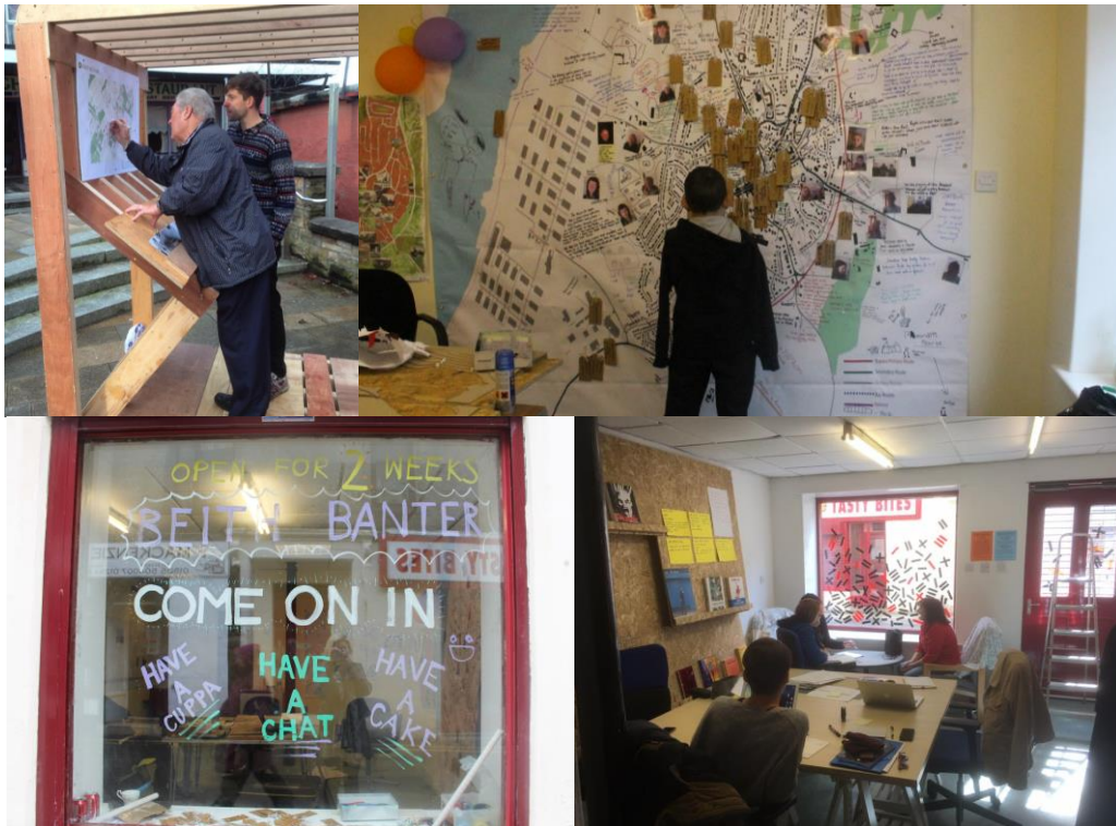
Figure 8: (Top left, clockwise) Public kiosk - 'One thing that would make Beith better?...' / 'Things to do in Beith?'; Beith Past and Present interactive map; Beith Banter - drop-in centre on Main Street; Project Main Street pop-up shop.

AMPS, Architecture_MPS; Liverpool John Moores University 08–09 September, 2016