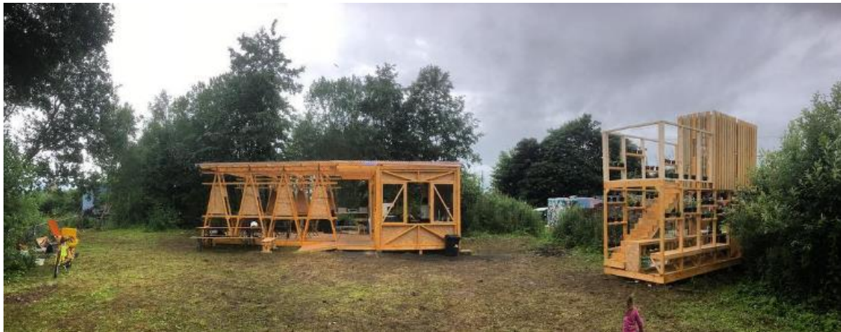
Figure 1: Test Unit, showing main pavilion (left) and 'The Nettle Inn' (right) under construction.

The Test Unit summer school had a discrete agenda: it wanted to supply an antidote to the customary participatory processes of talking, charrettes and oral consultations which had been applied to the site, but which had resulted in little actual improvement and a weariness and wariness amongst participating groups. Test Unit instead instigated the prototyping of physical things, small pavilions and installations designed and made by the participants with direction by Baxendale and other experts, as mechanisms for exploring the potential of the site as a discrete physical and social space, as a potential locus for urban creativity and as a setting for broader discussions about the nature and potential of urban renewal.