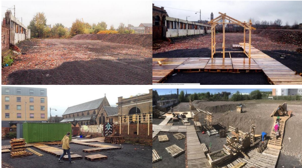
Figure 5: The site developing (clockwise from top left)

Pollockshields Playhouse was located on a brownfield site opposite the Tramway and could be read spatially as deriving much of its identity from Tramway's agenda of creativity and co-operation. However, it differed insofar as the Playhouse was public space which was wide open to interpretation - it was just a big, walled space with a quite small gate and lots of rubble. But insofar as it was practicable, Playhouse was unbounded which allowed programmes of social activities to emerge in space according to the identity of Pollockshields as a singular place. In this way, the Playhouse acted as a framework onto which socio-culturally relevant programmes could be applied and tested.