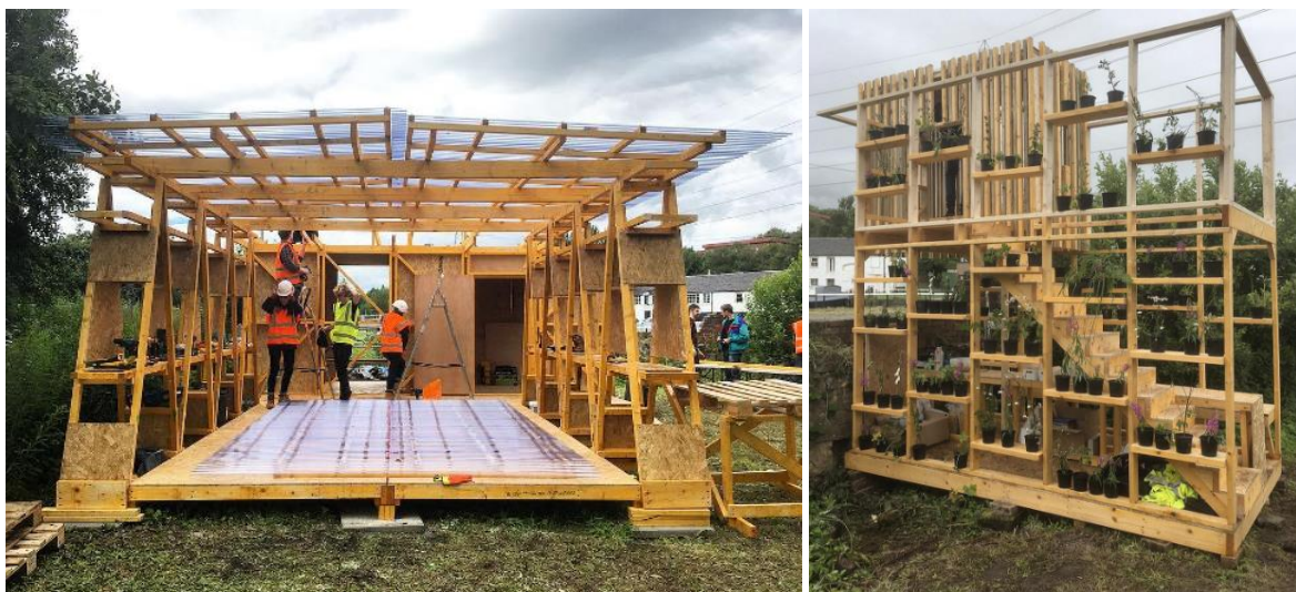
Figure 2: Test Unit, showing main pavilion under construction (left) and 'The Nettle Inn' (right).

By developing the site in a single week, Test Unit also demonstrated the potential of a shorter development process to parties invested in the site, both in terms of how quality occupation can be achieved quickly - it doesn't have to be slow and arduous - but also how knowledge about urban space can be more effectively revealed through the act of design-making rather than talking. In addition, as a live process Test Unit avoided the tendency towards abstraction that can declaw participatory practice - the work remained vital.