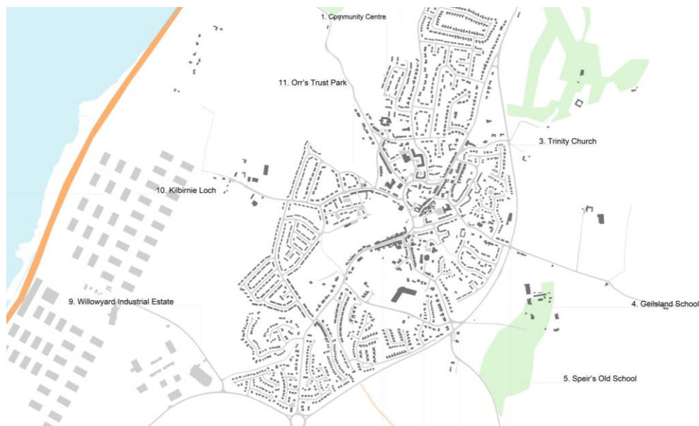
Figure 7: Mapping the key areas which flagged up in the engagement exercise.

AMPS, Architecture_MPS; Liverpool John Moores University 08–09 September, 2016