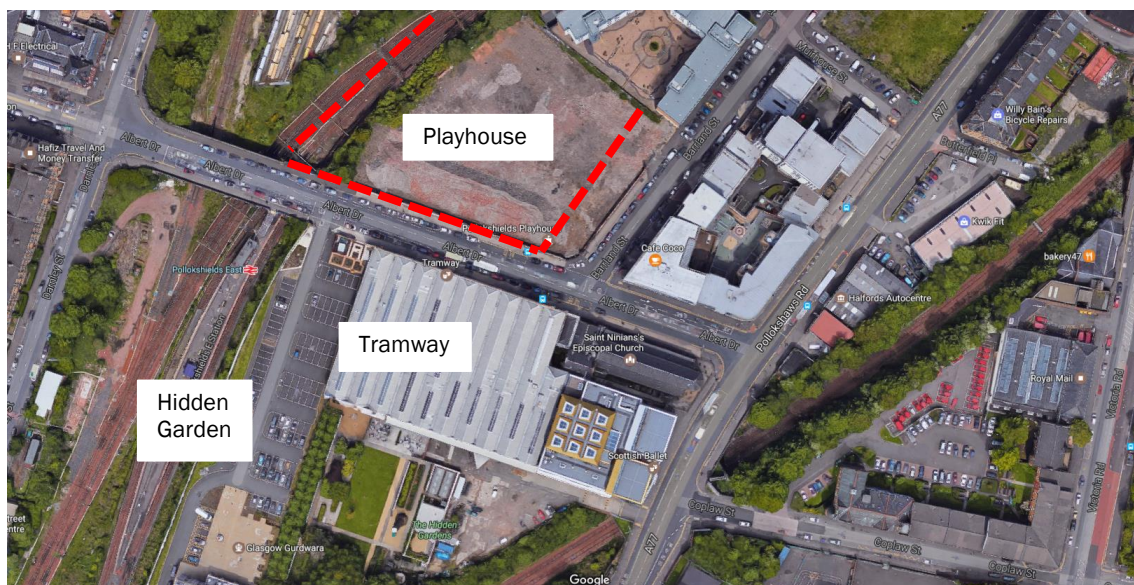
Figure 4: Playhouse in context (Image from Google Maps. Accessed 26.

The area of Pollockshields has a significant low-income, ethnic minority community living alongside an increasingly middle-class population attracted by traditional housing, proximity to the urban core and an attractive cultural context. This gentrification was stimulated (if not entirely started) by the development in 1988 of a disused tram depot into Tramway, an arts centre, extended to its rear in 2003 by the development of The Hidden Gardens as a space for intercultural community building.