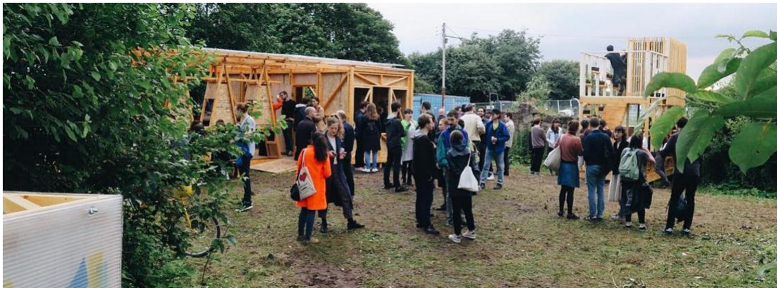
Figure 3: Test Unit, complete and with an event in full swing.

social experience, promotion, site development and occupation and ideas generation, as well as visibility and community engagement - through a process of spatial prototyping and by demonstrating capacity - in a week on a very marginal site interventions were developed which not only improved the public realm in a very direct way, but also produced public space through the development of new social activities, consolidated in built fabric.