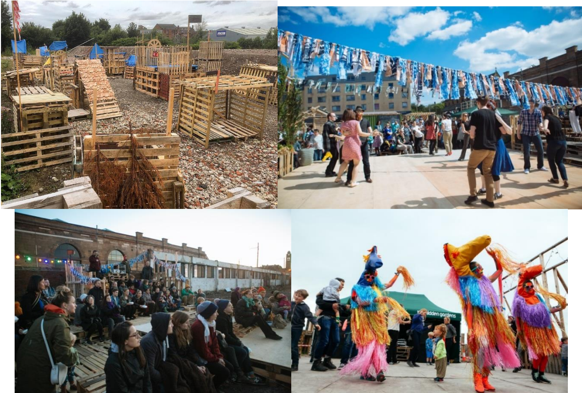
Figure 6: Activities on-site (clockwise, top-left) - Tinker Town; dance; theatre; carnival.

AMPS, Architecture_MPS; Liverpool John Moores University 08-09 September, 2016