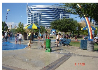
d-Tempe Beach Lake