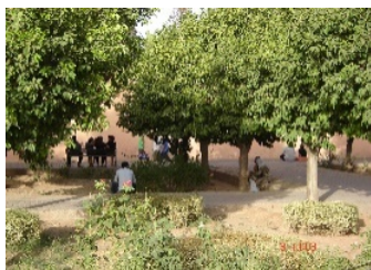
a-Al Koutoubia Garden