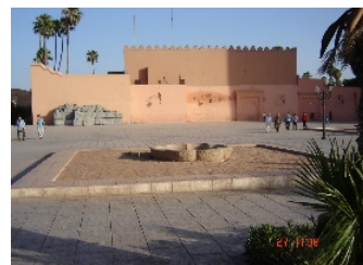
b-Al Koutoubia Plaza