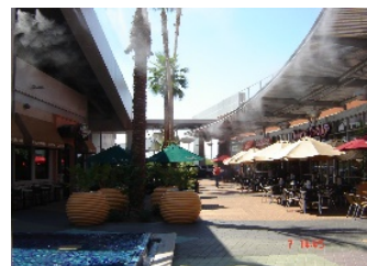
e-Tempe Market place