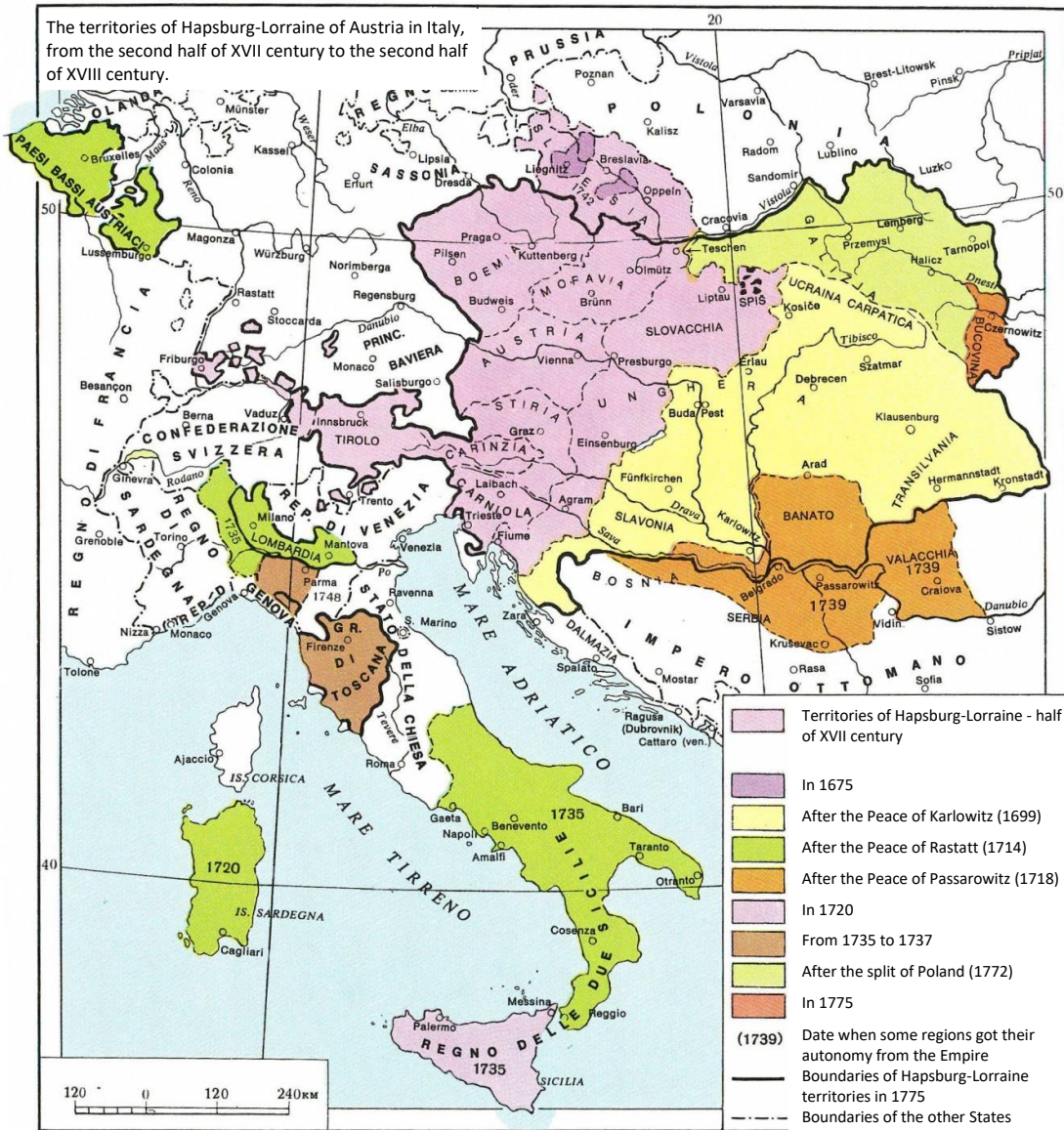
Figure 1 - Hapsburg-Lorraine Empire and Grand Duchy of Tuscany

Source: Elaboration from Homo laicus, modern history, historical maps. Available at: http://www.homolaicus.com/storia/moderna/monarchie_nazionali/guerra_trentanni2.htm (accessed on 8 October 2017).