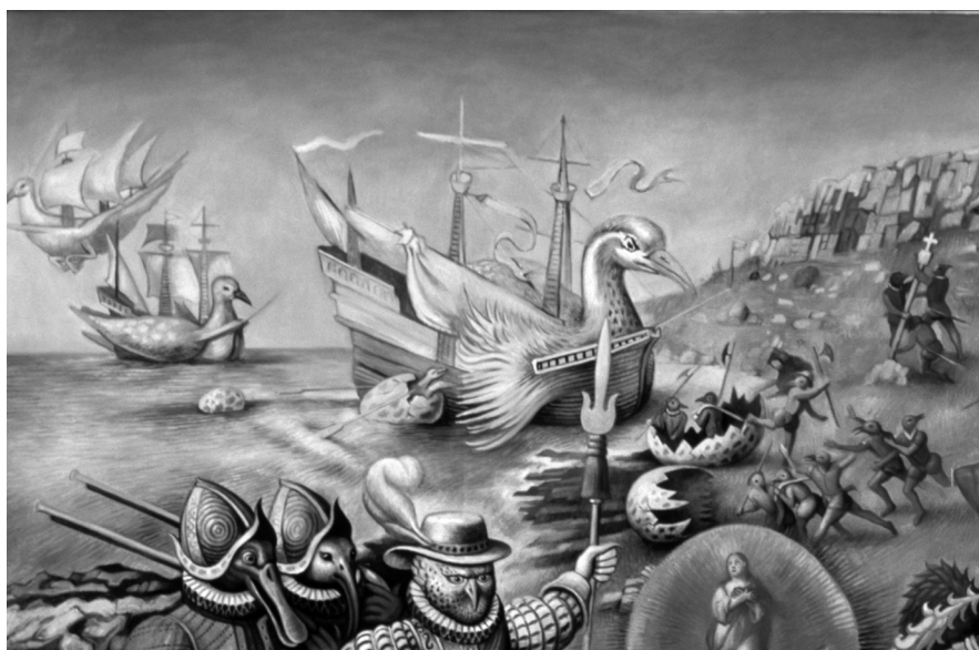
Fig. 1: Cyril Coetzee, T'kama-Adamastor (as fig. 3), detail

idea of the masculine ship entering into some kind of sexual union with the ocean is reinforced in the poem by Camões's choice of Venus, the deity of erotic love, as the fleet's patron goddess, and by her later gift to the crew of explicitly sexual adventures on the Isle of Love (canto nine). It is not a long metaphorical journey from the phallic power and fecundity that this ship symbolically carries into the Indian Ocean, to Brink's fertile, imperial, hatching eggs that spill the white explorers onto an African beach.