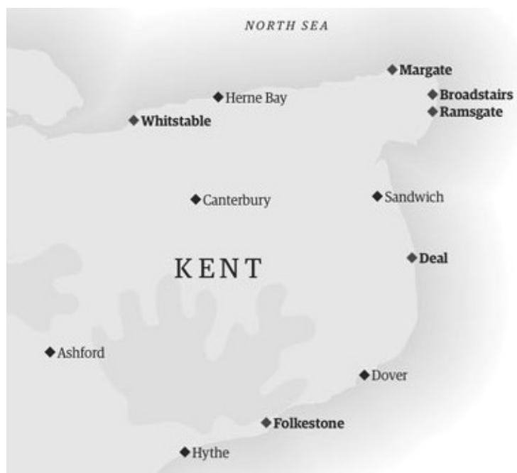
Figure 1. East Kent

Modern Herne Bay is a coastal town situated on the north Kent coast, fronting the Thames Estuary, situated fifty five miles east of London (Charing Cross). Whitstable lies four and one half miles to the west, Margate eleven miles to the east and Canterbury seven miles to the south. 38 These distances are based on a direct linear route "as the crow flies" and in each case the mileage is by necessity increased if consideration is taken of transport routes, such as road or rail. A map is included in figure 1 to show the location of Herne Bay in the context of East Kent.