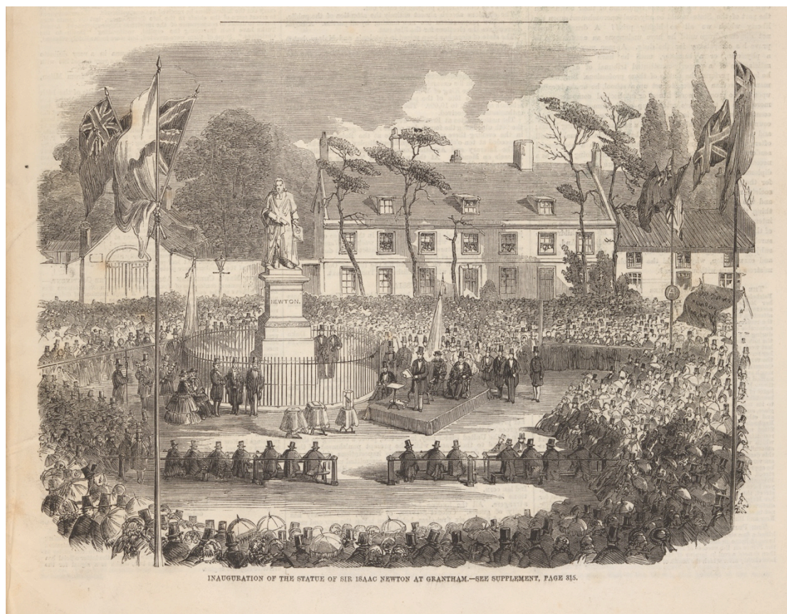
Figure 2: 'Inauguration of the Statue of Sir Isaac Newton', Illustrated London News 33 (1858), p. 299. The telescope, in its glass case, is displayed in front of the statue alongside a copy of Newton's Principia and a prism.

Far less visually appealing, but continually secured and accounted for, were the Huygens lenses (Fig. 3). Their significance in the history of optical science has prompted a succession of individuals from the eighteenth to the twenty-first centuries to explore and make use of them. 66 While the personal associations are there – the lenses bear original signatures and later inscriptions record that they were 'made by the celebrated Huygens' – they required an active and technical engagement of their devotees. 67 Attempts were made to explore their optical qualities and, until the late nineteenth century, to use the lenses for new observations. This was also a means of treading in the footsteps of celebrated forebears. It was 'desirable to form a just estimate of the tools with which our ancestors worked' or to understand 'how they contrived to get the eye and object-glasses of these unweildly [sic] machines married, or brought parallel to each other for perfect vision'. 68 Among the encounters that were inscribed on the lenses themselves was that of William Derham, who