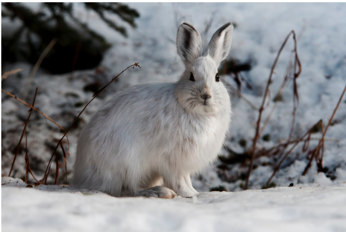
Figure 1: Snowshoes hare in its natural habitat.