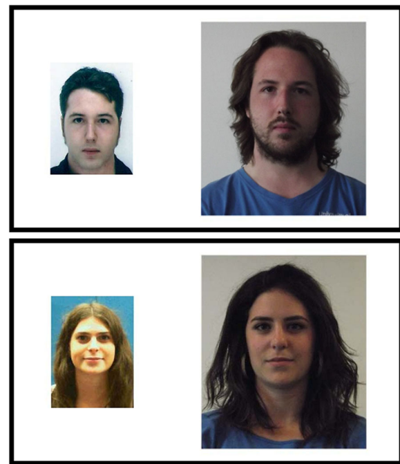
Fig. 2 Example stimuli from the Kent Face Matching Test (KFMT; Fysh & Bindemann, 2018). The top pair depicts an identity match, whereas the bottom pair depicts an identity mismatch

asked to identify the target from a three-face array containing two distractor images alongside the studied identity. In the second block, six different but concurrent faces were studied for 20 s. Observers were then presented with a series of three-face arrays containing one target face and two distractor identities and were required to select which face was previously studied. The third block of the task was conceptually similar to the second block, but with the addition of Gaussian noise on top of face images, to further increase the difficulty of the task. In the final block, observers were presented with 30 additional trials that feature heavily degraded face images varying in expression and pose. Example stimuli from each block are displayed in Fig. 3.