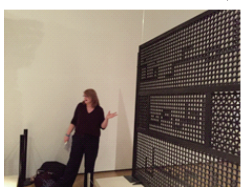
Figure 1: Hefuna's mashrabiya screen

The screen can be viewed by any of the visitors to the lower ground floor of the Sainsbury's Galleries located within the museum. As an art object it is striking – located within the African section, it is an imposing and freestanding piece that measures just over two metres wide and two metres tall, easily one of the larger objects in the gallery in which it resides. Its apparently 1:1 ratio with the mashrabiya screens whose form it appropriates naturally disturbs the borders of art and artefact – if you needed such a screen for a house you could quite easily adopt Hefuna's for the purpose. Indeed, those unfamiliar with mashrabiya screens may wonder at the relation between source and art object, between art and craft, and between facsimile and fake. Visitors to the gallery might begin to wonder whether the art in Hefuna's creation lies just in the insertion of the Arabic text, the rest of the object perhaps remaining unremarkably standard in form and construction. For now it is enough to imagine the bulk and heft of the piece and to realise that the photograph in the British Museum collection cannot do justice to its physical impact.