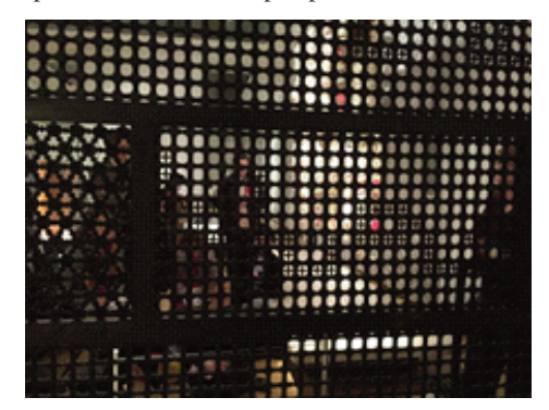
Figure 2: Inside and outside