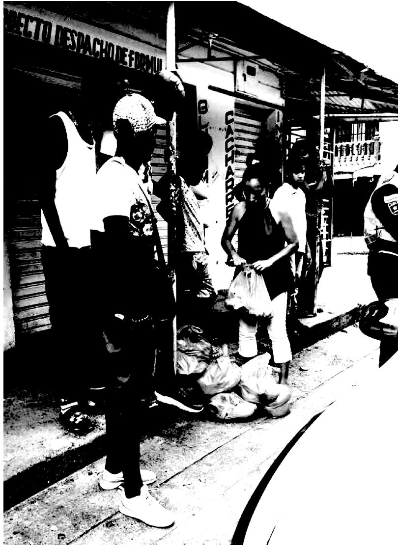
Fig. 4. Delivery of basic staples, part of a program of early intervention into petty crime in Cali.