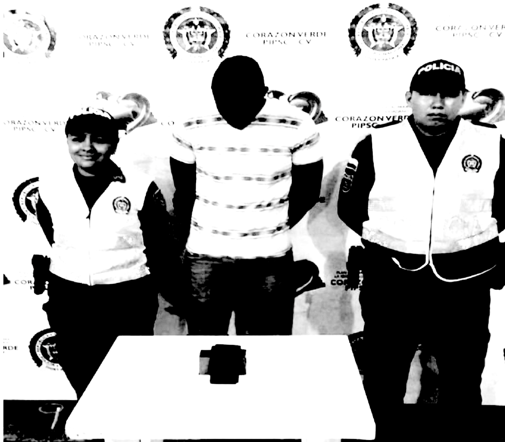
Fig. 1. Mobile thief captured by local police in Cali (HSBNoticias.com, 24 Sep. 2015).

In this context, Cali has become a privileged place in which to test the new range of discourses and developmental practices associated with security, which we began to describe in the introduction. Known by the general label of Security and Development, these new practices and discourses are part of a recent ‘know-how’ and a new chapter of global governance which aims to achieve public security, or what is also known as ‘citizenship security’, in cities like Cali. 9 Interestingly in Cali, as we will see, the decision of the city's administrative organs to embrace the Security and Development agenda has not been accompanied by the expansion of the typical ‘firm hand’ associated