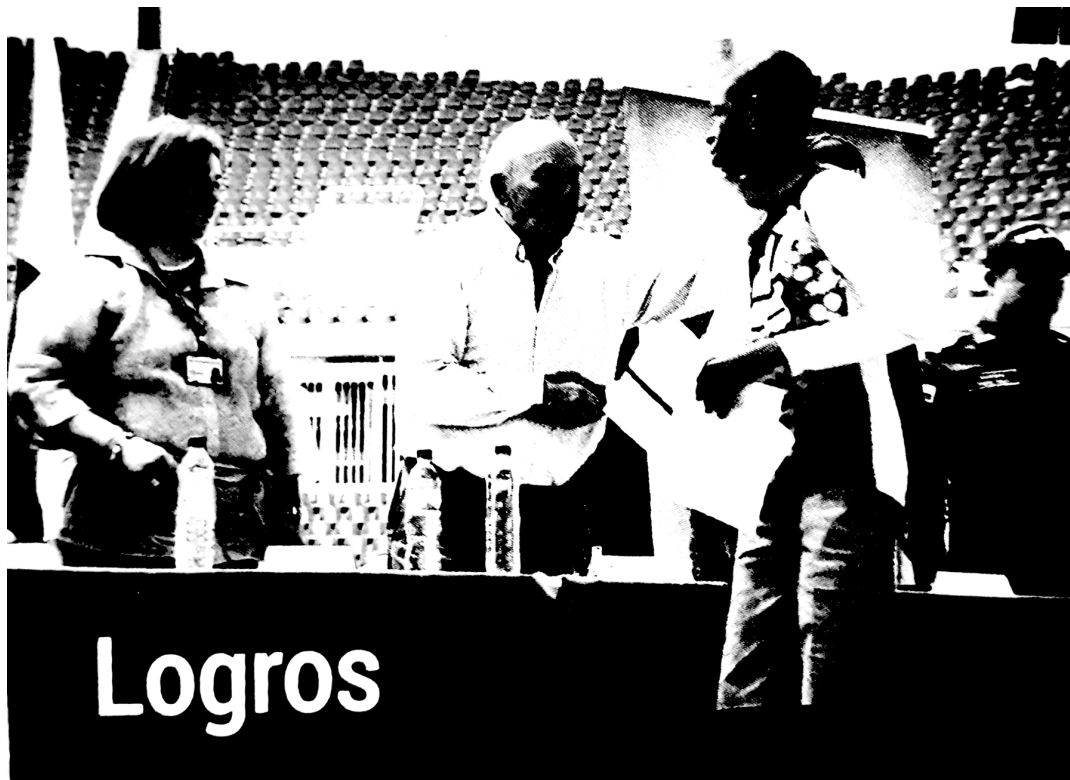
Fig. 2. Cali's mayor, Maurice Armitage, congratulating a young man who benefited from the Youth without Borders programme ( Jóvenes sin Fronteras ), one of the schemes created by the local administration to 'integrate' young people involved in gangs into the city's formal life. Photo included in the official brochure of the programme (2016).

The new Security and Development practices just described rely on what we call 'neo-developmental punitive technologies'. These technologies often combine conditional services with psychosocial attention offered to vulnerable young people as a tool of crime dissuasion and social inclusion. As we show in the next sections, these 'conditional services' materialize in the form of employment, sport, education and more general care services delivered by public and private institutions and community police officers in partnership with local actors and the local administration, on condition of behavioural change on the part of their young recipients. These conditional services represent a brave attempt to return to pre-neoliberal times in which welfare, in particular full employment, or the aspiration to generate it, constituted the organisational force behind state action and the construction of citizenship (Esping-Andersen 1999). However, these benefits and employment options are now not only 'conditional' but also very limited. This is due to the national and local government's financial