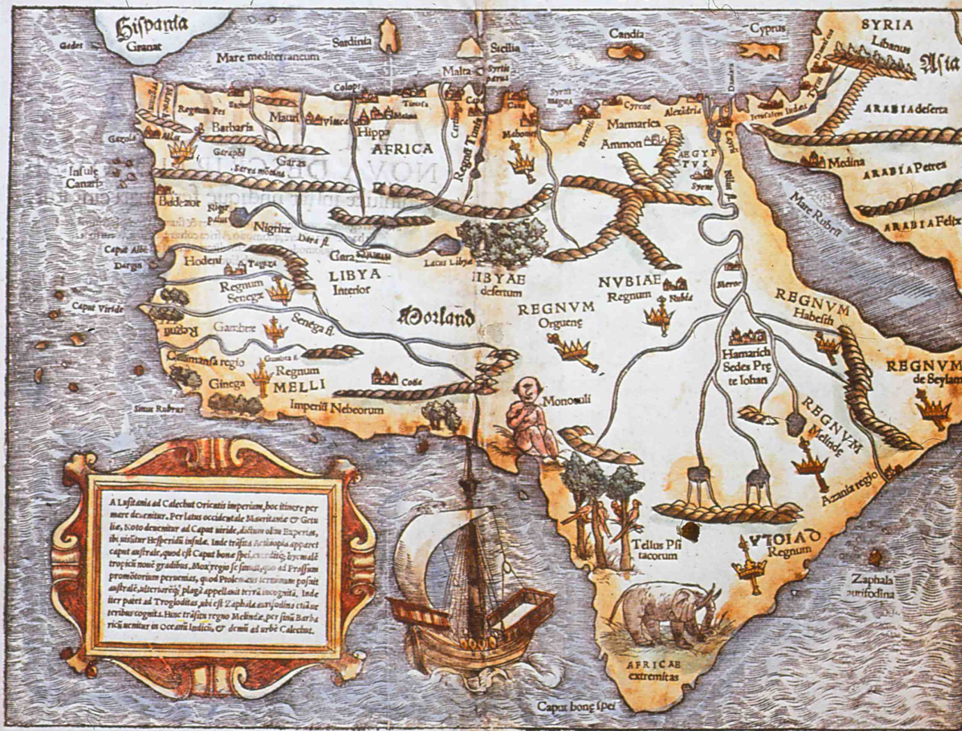
Fig. 1: Map of Africa by Sebastian Münster (1540). Herzog-August-Bibliothek Wolfenbüttel (shelf-mark: H: T 10.2°)