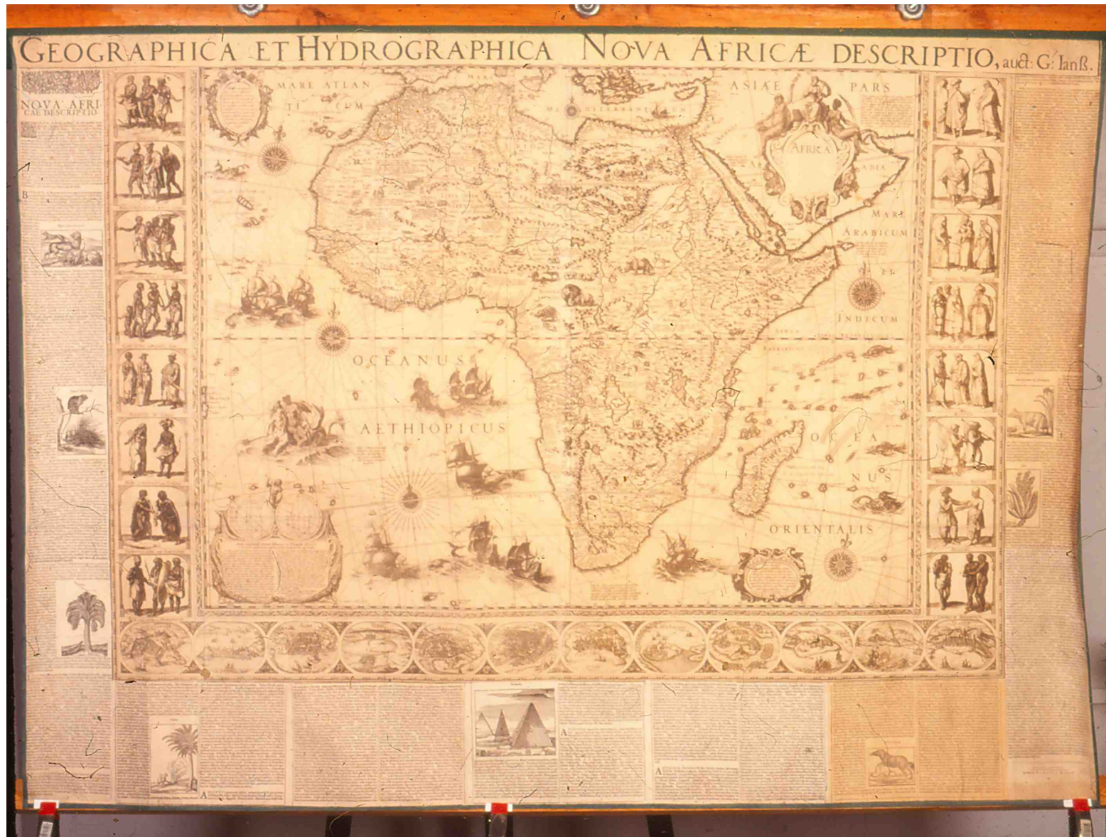
Fig. 3: Wall map of Africa by Willem Janszoon Blaeu (1624). First state 1608. Dimensions: 1.20m x 1.70m. Herzogin Anna Amalia Bibliothek, Weimar (shelf-mark: 90-K, N°LXXIII)