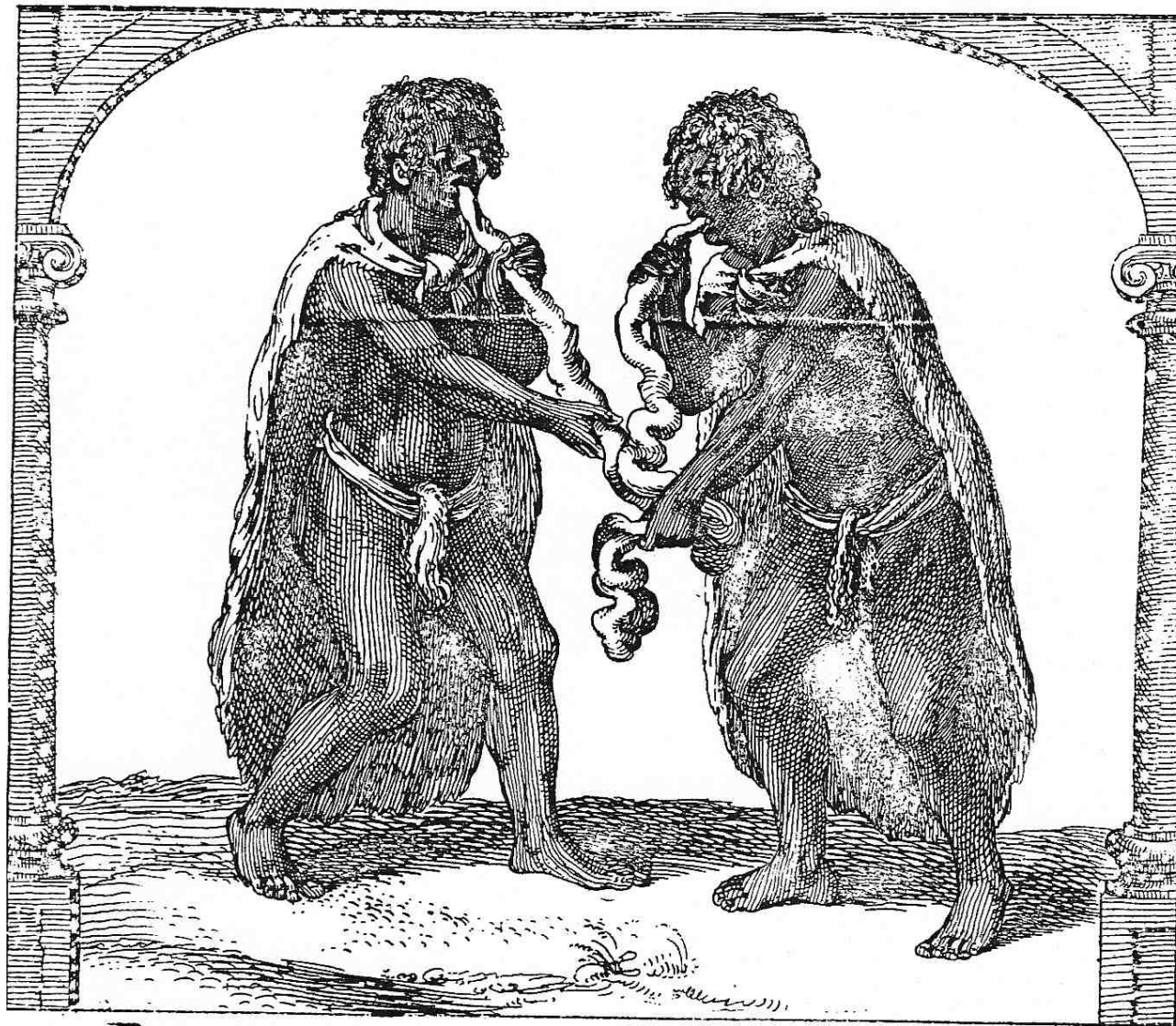
PROMONTORII BONÆ SPÆI HABITATORES .