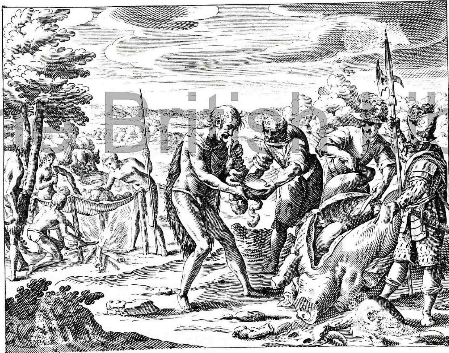
Fig. 6: An early image of the Khoikhoi at the Cape of Good Hope. From Johann Theodor and Johann Israel de Bry, India Orientalis , vol. 3 (1599).