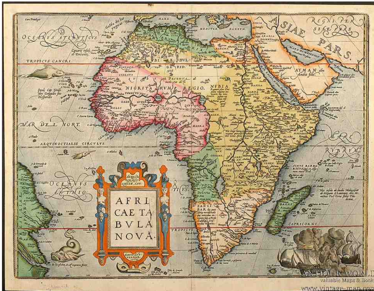
Fig. 2: Map of Africa in Abraham Ortelius, Theatrum Orbis Terrarum (1570). Stadt- und Universitätsbibliothek Frankfurt am Main (shelf-mark: Wf 127)