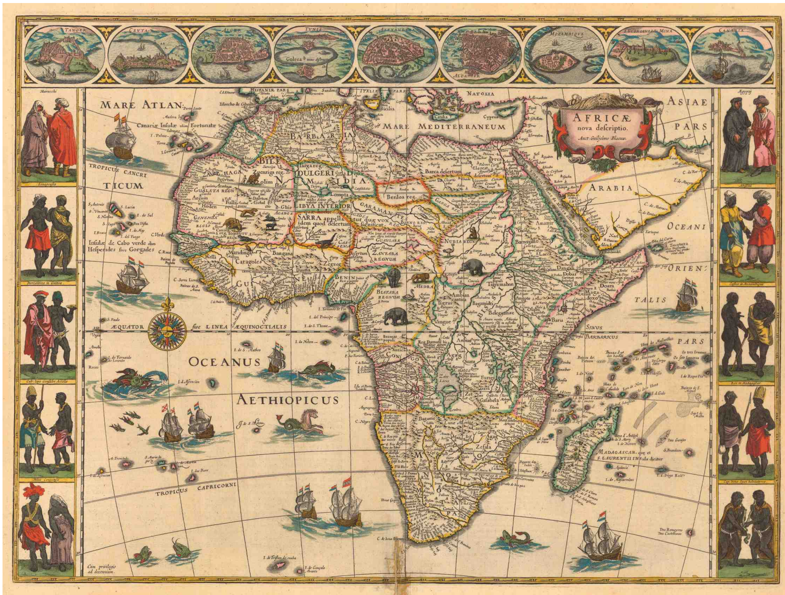
Fig. 4: Map of Africa by Willem Janszoon Blaeu (1644). First state 1617.