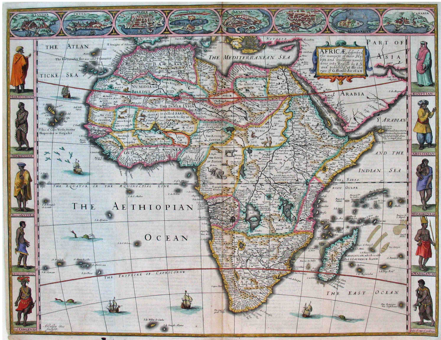
Fig. 5: Map of Africa by John Speed (1626).