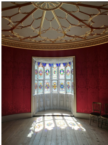
Round Room

The famous letter to Horace Mann would have been written at Walpole’s house in Arlington Street, but the architecture of Strawberry Hill House is a testament to the way the man thought, and is where he did much of his work.