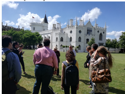
Gathered outside Strawberry Hill House

On the 15th June 2017, a diverse group of researchers in computing, arts, sciences, and other fields of cultural endeavour met at the Waldegrave Drawing Room, St Mary's University, to discuss serendipity – “the art of making an unsought finding” [11]. The core goals of the symposium were to relate various understandings of serendipity from different disciplines, and to discuss contentious questions such as whether/how serendipity can be supported or simulated by computational means.