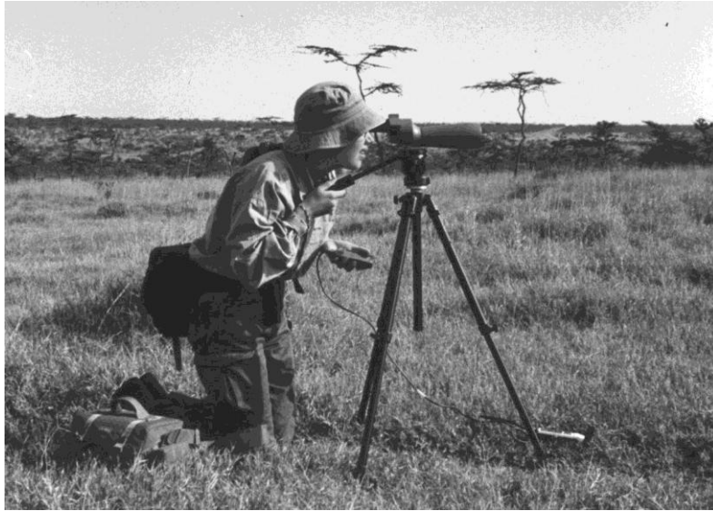
Figure 4 - The ecologist observes the giraffe whilst simultaneously recording data on the PalmPilot using indirect interaction techniques.

We are exploring other methods to maximise the indirect operation of our prototype. The touch-sensitive screen provides one opportunity. If divided into selectable areas, let us say four quadrants, a particular function or data value can be assigned to each of the quadrants, e.g. a tree species selector where top-left = acacia, top-right = uclea, bottom-left = scutia, bottom-right = other. The user can easily identify the four corners of the screen with their thumb and hence operate the interface in eyes-free mode (especially if some form of audio feedback is given). Although we may not be able to divide the screen into enough areas to support all functions or data types we can certainly implement the most frequently required options to optimise for an eyes-free mode of operation.