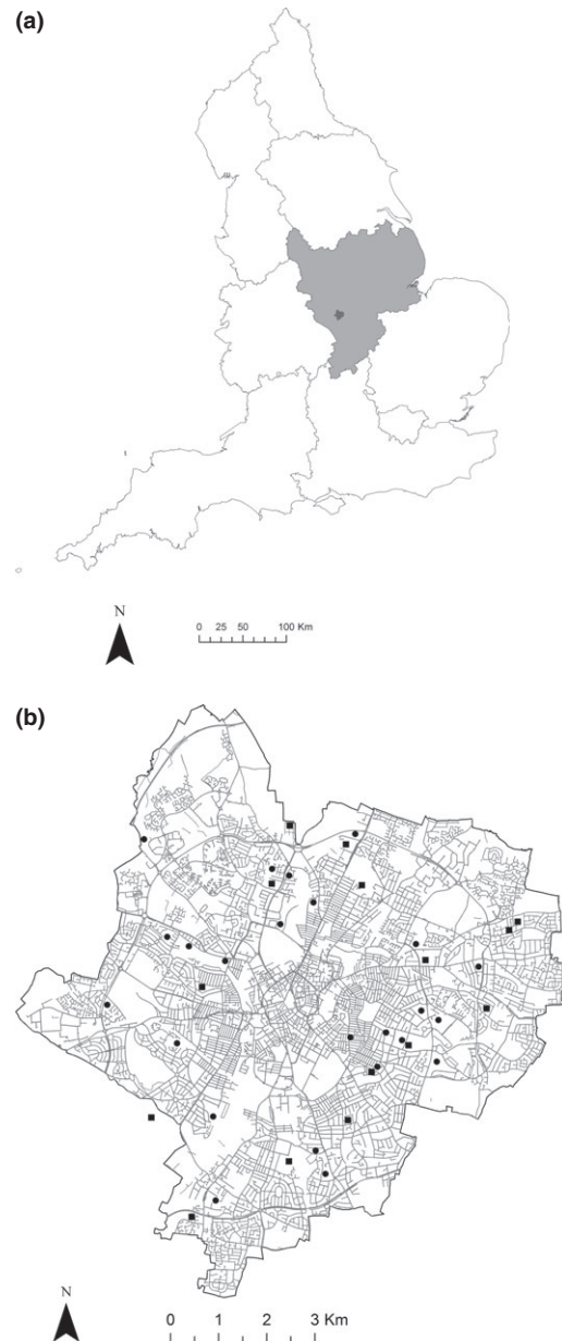
Fig. 1. (a) The geographical location of the East Midlands within England and our study city, Leicester, and (b) the position of allotments within Leicester. Square symbols represent allotment sites sampled; circular symbols are unvisited allotment sites.

Allotment provision in Leicester peaked in the 1930s, with one household in three renting a plot (Crouch & Ward 1997). Today, the city has 46 allotment sites (Fig. 1b), 45 of which are owned by Leicester City Council with 3200 individual plots (Leicester City Council 2012) that in total cover c. 2% of the city's greenspace. Within the city, greenspace constitutes 56% of the total area with 32% managed on a small scale privately in domestic gardens, and the remaining 68% is non-domestic greenspace generally managed on a large scale by Leicester City Council or large institutions.