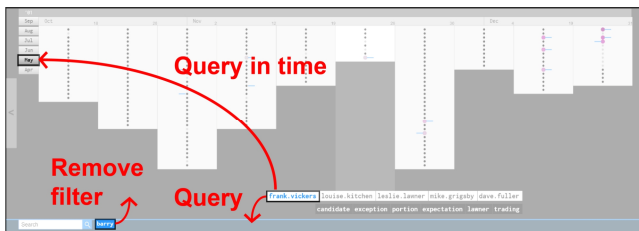
Figure 3: Tags can be dragged to modify the query.

Data and view specification —mailVis enables navigation in time by pointing to months or the ‘newer’ and ‘older’ buttons (Figure 1, on the right and left edges). Suggested keywords and contacts can be used as query items by dragging them into and out of the query field (Figure 3). Querying with an item within a specific time period can be realized in a single action by placing the keyword or contact tag on a month (Figure 3).