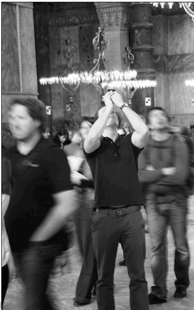
Photo. 1. Photographic urge in Istanbul.

Aware of the complications enclosed in these claims, I visited and took my photographs of Istanbul's everyday while keeping an eye on the structural tensions already lying beneath of the surface of the city. The results of my trip, therefore, had nothing in common with the spectacular and moving images of brave Turkish youth or the dreadful images of violent police actions that came to inundate television and computer screens across the world just a month later. Instead, I came home with a collection of vignettes of everyday life in Istanbul: ordinary photographs that once 'consciously explored' – as Walter Benjamin would put it – become prolegomena of what would later turn out to be a new exceptional international event. 21