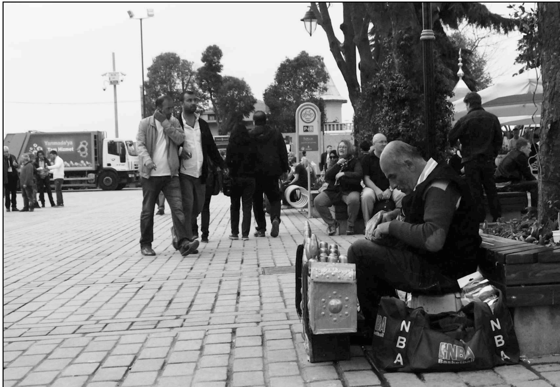
Photo. 17. Narrow paths.