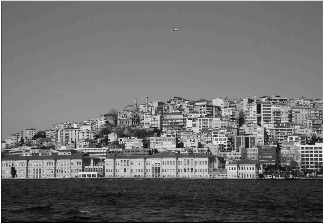
Photo. 21. So local, so international.

This domestic internalization of the international is, of course, mediated by intense creolizations, judicial and legislative reconstructions, and popular acts of refusal or strategic re-appropriation. Nonetheless, transmogrified as domestic, international aspirations and commitments are often perceived as having an unmediated relation with local constituencies. What prevails is a form of mediated administration between the international and domestic orders: one in which international commitments and obligations are constantly re-embodied as national or local. In these processes, domestic transformations are executed through municipal authorities, actors, norms and things, while carrying within themselves, the ethos of international law.