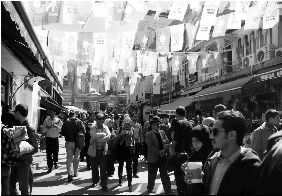
Photo. 3. The state and its festive side..

In a subtler, but perhaps more resilient way, nation-states also bring into being the idea of an international world through their ubiquity in our daily life. It is thanks to this silent, but endemic presence that nation-states become even able to dominate those sites that we believe lie beyond the official. Underpinning the very existence of nation-states there is, thus, that capacity to occupy our actions, thoughts, geographies and emotions without permission or validation. It is of their nature to be disrespectful of the politics of hospitality. 35 Their ethos and elites, as well as their signs and symbols, continually walk into our lives without previous announcement, while immediately requesting their recognition. In official, but also in ordinary events and spaces, we are therefore constantly being required to be part of an international world. It is as a result of this everyday, yet still forceful performativity engendered in the existence of the nation-state, that a simple national flag, at the stern of an ordinary urban ferry in Istanbul, puts us again into a persuasive communion with that world that has resulted from international law. (See photo. 4).