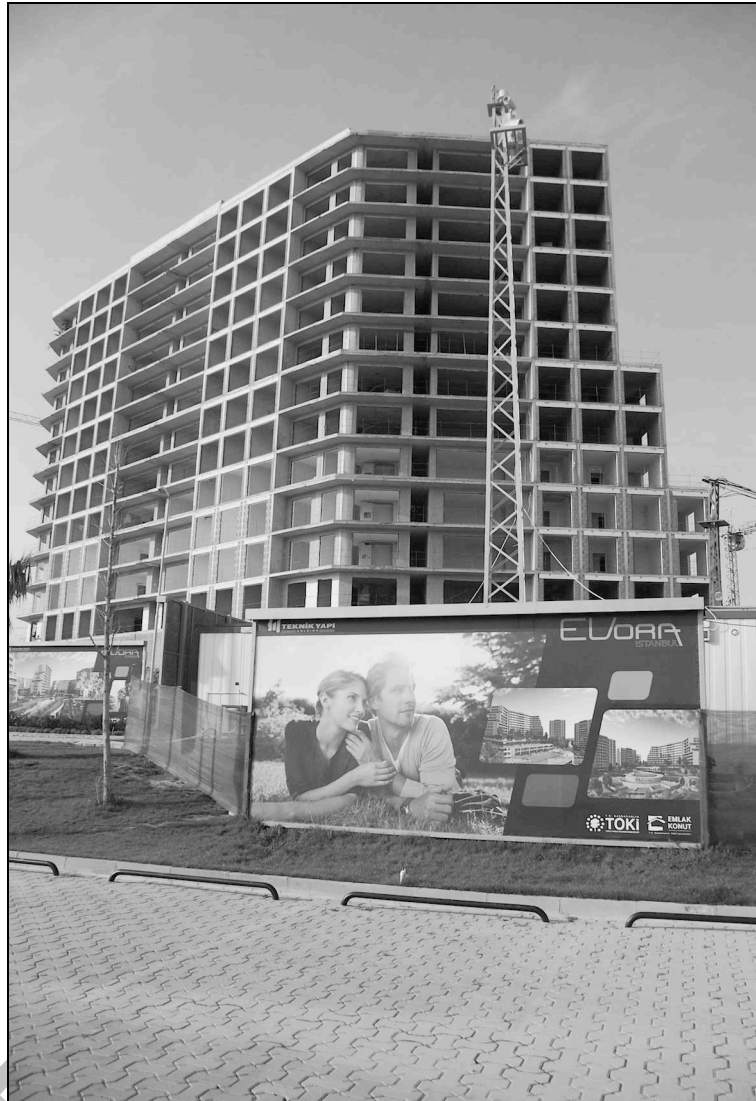
Photo. 18. Between the real and the ideal.

can even take the form of a young white couple enjoying a relaxing day on the grass. (See photo. 18).