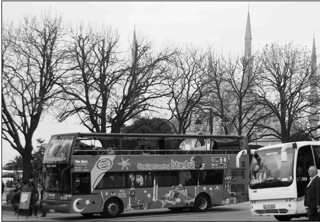
Photo. 10. Spectacles of internationalization.

many global cities) against a centuries old mosque reveals, in this way, the different economic and political arrangement experienced in the city, and how immediate is the request for residents to adapt themselves to the new order. (See photo. 10).