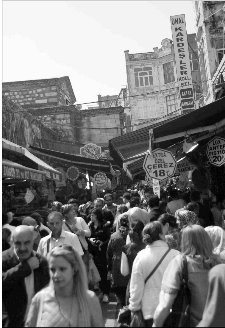
Photo. 5. Viral market.