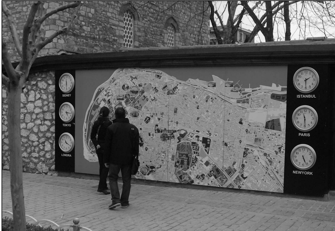
Photo. 14. Timing world.

standardizations, which similar to the newer mechanisms enjoy international and domestic legal endorsement. 67 As time articulates, to the smallest detail, our increasingly busy modern days with happenings in other parts of our cities, nations and the world, currency exchanges synchronize individual, municipal, and national finances with the passions of the global economic order. Interestingly, the deployment of these mechanisms of individual legibility occur in an ambience of naturalized uneventfulness, and sanitized and distanced from questions about, for example, the disciplinary function of time or money. What we do observe on our streets, however, are expressions of how much fascination the global ethos of time and money continue to produce. In these expressions, like the ones that we can observe in the following two photographs in Istanbul, the feeling of being in time with the world, and immersed in the midst of currency exchanges, become localized objects of cosmopolitan fetishism. (See photo. 14 and 15).