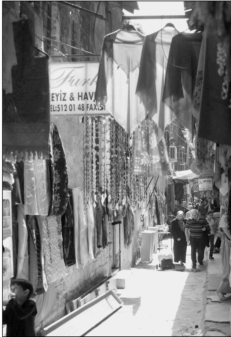
Photo. 7. Commodities and mimesis.

As objects of exchange that navigate the planet through torrents of norms and levels of government, commodities contain within themselves the world – a world that they make. In their capacity as world-makers, commodities redraw social geographies permanently, bringing the international order to our doorstep and drawing it over our bodies, shifting and attesting to what we want, where we work, how much we earn, and how we enjoy and survive life. Commodities remind us clearly that the international normative order is more like a rich archipelago of social and material transactions than a tidy vertical legal assemblage – more Malinowskian than Kelsenian, more horizontal than pyramidal. 42 In this archipelago, commodities far from being neutral or neatly boxed within a particular jurisdictional sphere, operate instead as containers and reproducers of history and power relations.