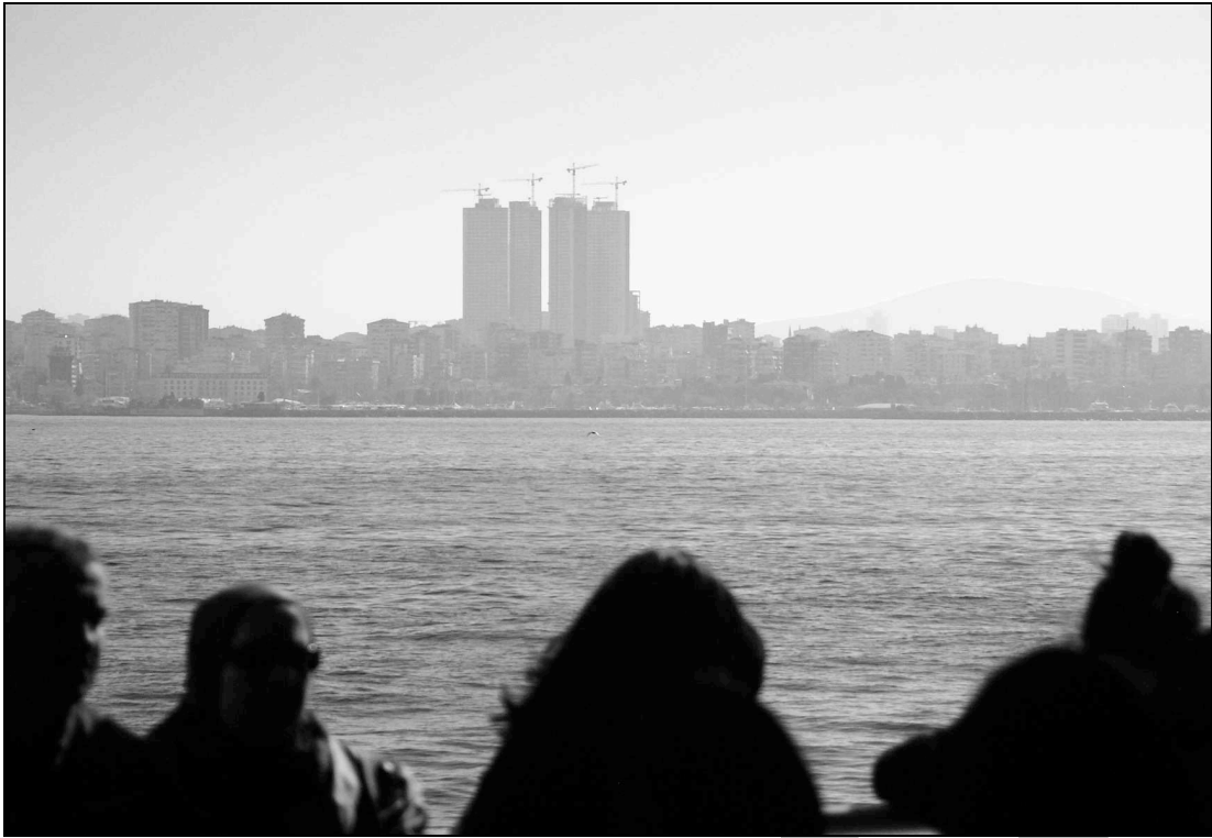
Photo. 11. Localized behemoths.

But one only needs to get closer, to zoom-in slightly, to realize the vast impact that the current internationalization of cities is having on local affairs. In the traces of social and cultural displacements; in the broken windows and drastically replaced pasts; in the half covered realities left behind by current urban revitalization projects; in all of these sites the observer is confronted with the violence of localities being reorganized to attend the aesthetic or functional capriciousness of new modalities of capital accumulation and power. And here, again, Istanbul has become a living showcase where we can witness this unromantic side of the current international order operating at the city's everyday level. (See photo. 12).