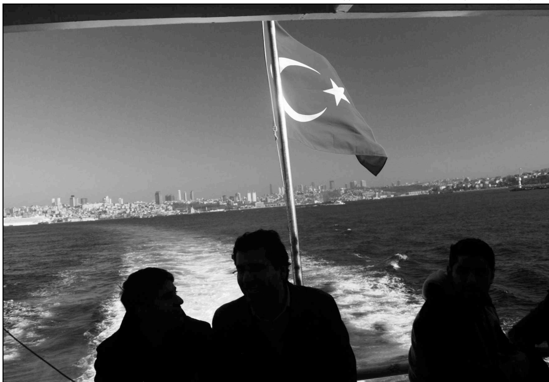
Photo. 4. The city, the flag, the world.