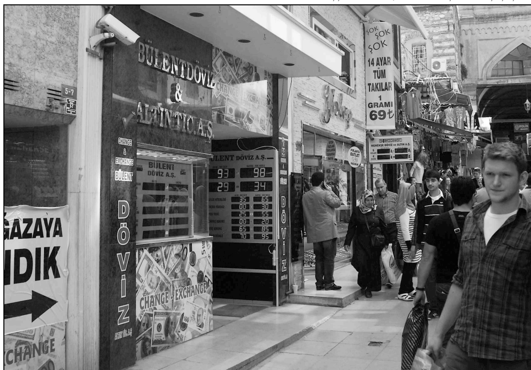
Photo. 15. The silent synchronizer.

So, running parallel to the pulling of realities towards a greater international legibility (an outwards pulling, as it were), the everyday operation of international law also involves the generation of specific type of territories and subjects. And the objective here is often to produce both national and, more recently local jurisdictions and individuals which, while attending to an international regime of legibility, are still able to regulate themselves in social, financial, and environmental terms. In this way, the outwards pulling of legibility comes with an inwards pull that aims to yield self-management.