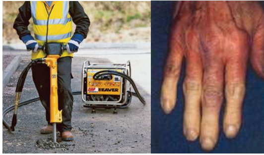
Figure 1: Left: A pneumatic drill in operation. Right: An operative's hand with white knuckle syndrome as a result of extended exposure to hand-arm vibrations.