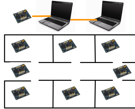
Figure 2. Demo topology

Each application on a sensing device runs inside a sandbox environment where access to hardware resources is only available through the Virtualisation Runtime . Previous examples of virtualisation in sensor nodes have focused on fully virtualising the host OS [1]. Instead we allow the applications to run as native process in a controlled environment. The Virtualisation Runtime performs a number of functions: