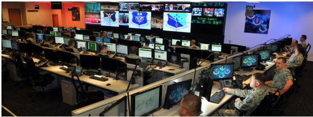
Fig. 1. A Security Operations Centre (SOC) [35]

The objective of a SOC is primarily to mitigate cyber-security threats towards the organisations for which they are responsible [42]. Internal SOCs are responsible for the organisations they are placed within, while multitenanted SOCs monitor network security on behalf of multiple client organisations. Figure II-A is an example of a SOC, with security data presented to security practitioners on computer monitors. Practitioners are frequently required to work long shifts, including night shifts, looking at multiple screens for extended time periods [40]. The resulting pressure and demanding nature of SOC work have been highlighted in HCI research [39], [40].