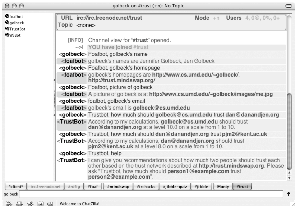
Figure 2: interactions between user (golbeck) and bots (TrustBot and foafbot). Both bots maintain a model built from Semantic Web data and use the IRC interface for receiving queries to those models.

A more complex issue on the Semantic Web is aggregating data into knowledge bases or unified data models. The nature of the Semantic Web as a distributed open system means that files containing interrelated data can be spread across any number of servers. To look at an entire data model requires aggregating all of the data contained in distributed files into a single model. To interact with the model, a user needs an interface to pose queries and view results. IRC bots have been used for this purpose in several contexts. The most popular bots work in the context of the Friend-Of-A-Friend (FOAF) project [2], and the Trust Project[7].