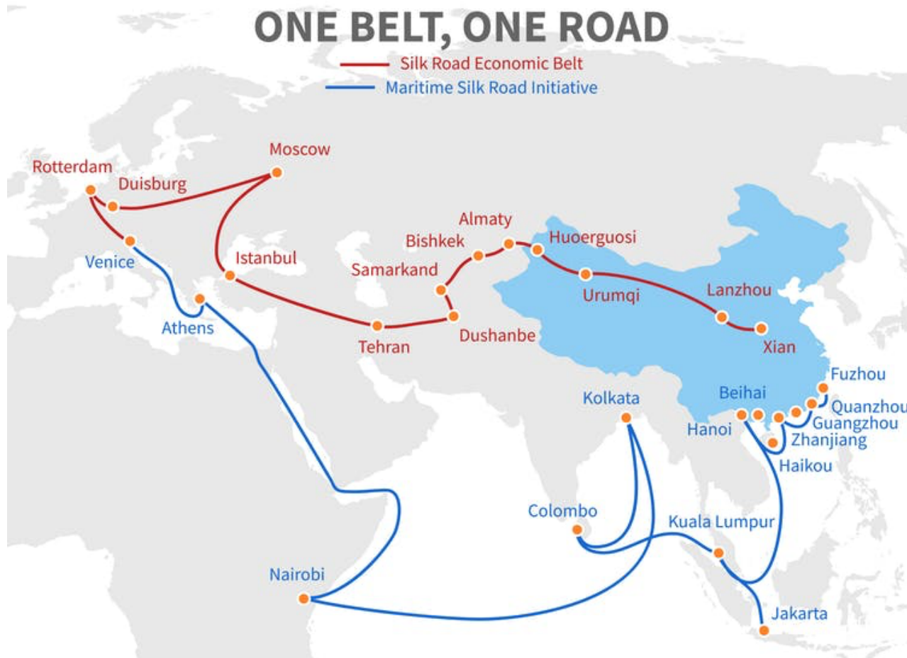
China's Belt and Road trade route.

land and maritime Silk Road. Since then, many Central and South Asian countries have signed cooperation agreements with China to invest in energy and transport infrastructure.