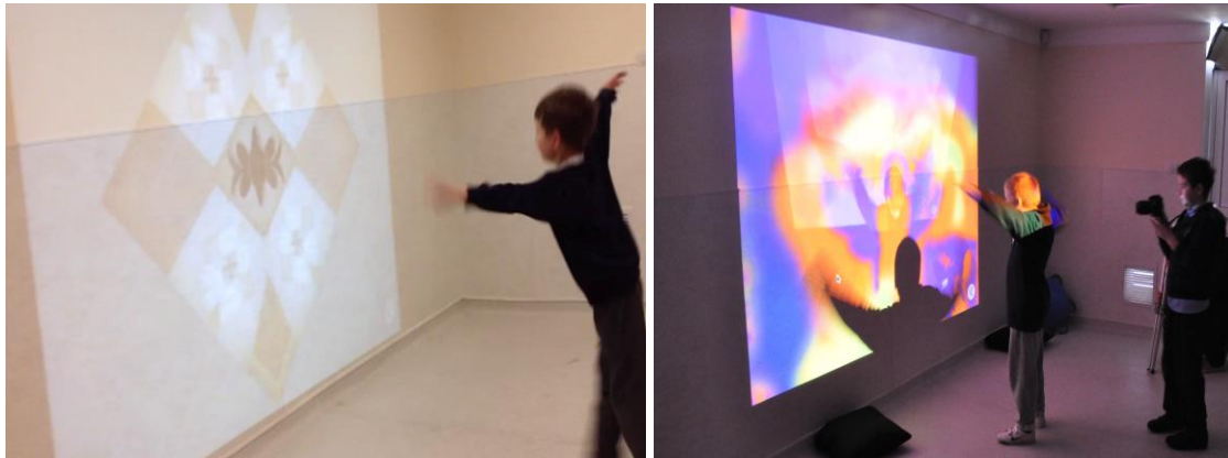
Figure 2. Somantics - Video mirroring ©Wendy Keay-Bright

appeared to enjoy seeing their bodies mirrored in motion, for others the video had the opposite effect, and they showed no interest, preferring the directness of the graphical responses.