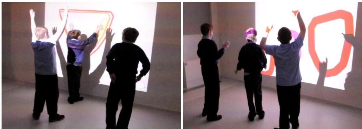
Figure 1. Somantics - Graphical effects ©Wendy Keay-Bright

The drawings and the body movements inspired us to create a series of storyboards that depicted the traces and flow of movement in relation to space. As these required imagining a scenario which was not yet in existence we asked art teachers for feedback, which informed the development of prototypes that used blob tracking and optical flow to capture and replay graphical representations of movement as lines, shapes or colour (figure 1).