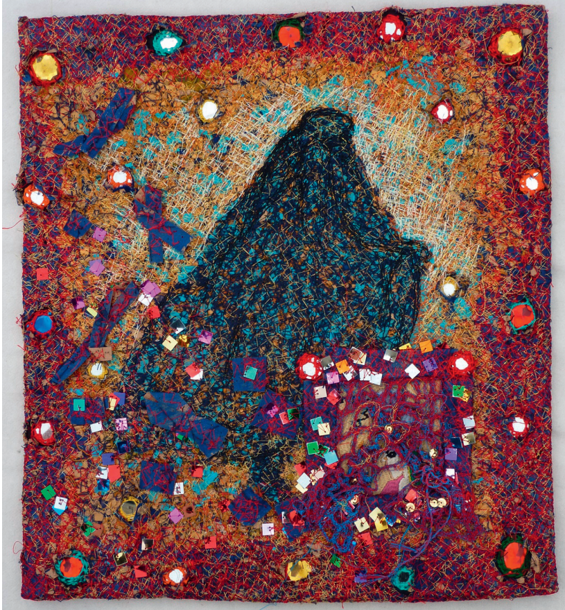
Figure 11. Yumiko Reynolds, UK, Hidden Beauties , 2007

quilt group's 'show and tell' to likewise engage with the cultural context in which the piece was conceived.