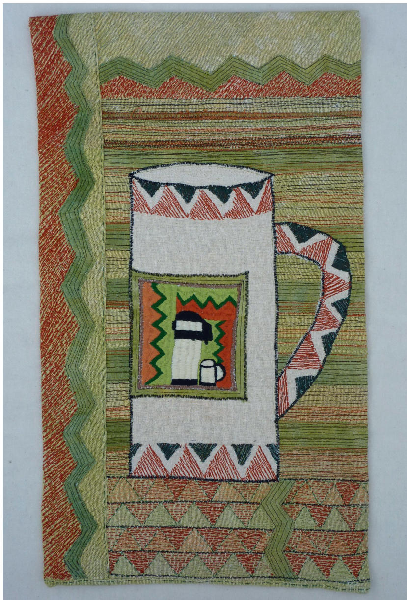
Figure 4. Sue Stone, UK, A Mug for Maira , 2007