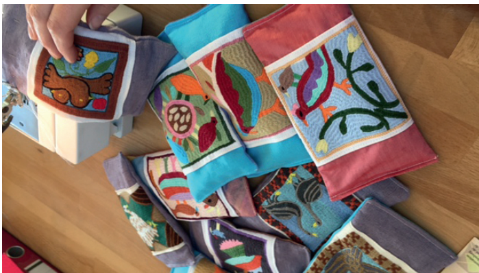
Figure 7. Sample works using embroidered Afghan squares: book covers by Sylvia Tischer from Germany (top), small pillows by Julie Herberger-Dittrich from Germany