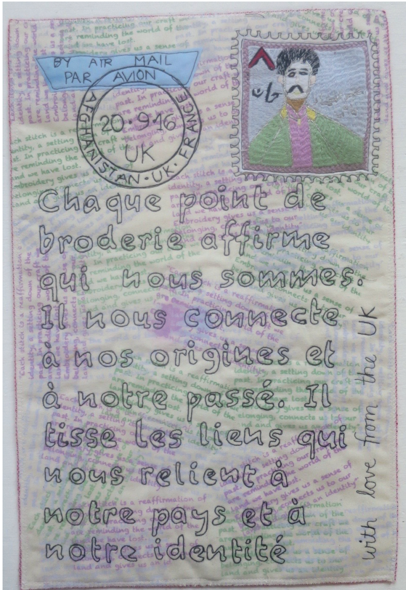
Figure 1. Gillian Travis, UK, Letter to my Friends , 2016, 29.7 cm x 42 cm (11.7 in. x 16.6 in.), screen-printing, embroidery and free-motion quilting (Credit: Gillian Travis)