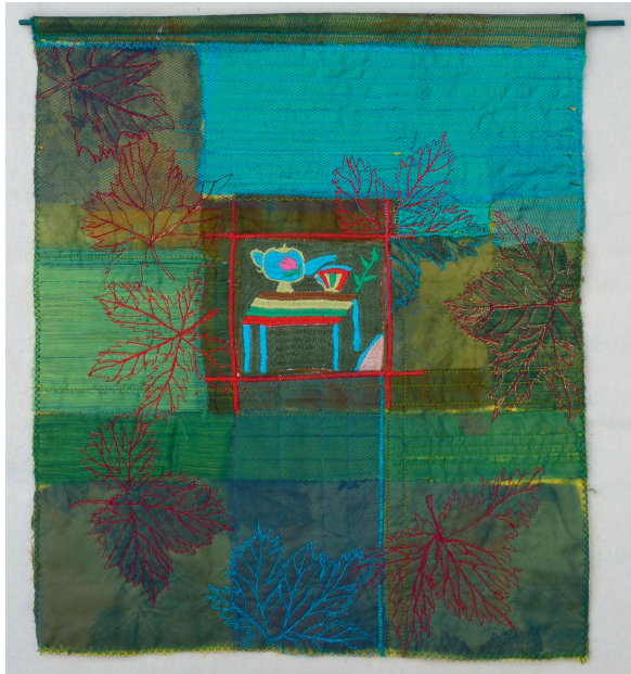
Figure 6. Liz Ashurst, UK, Tea in the Forest , 2007