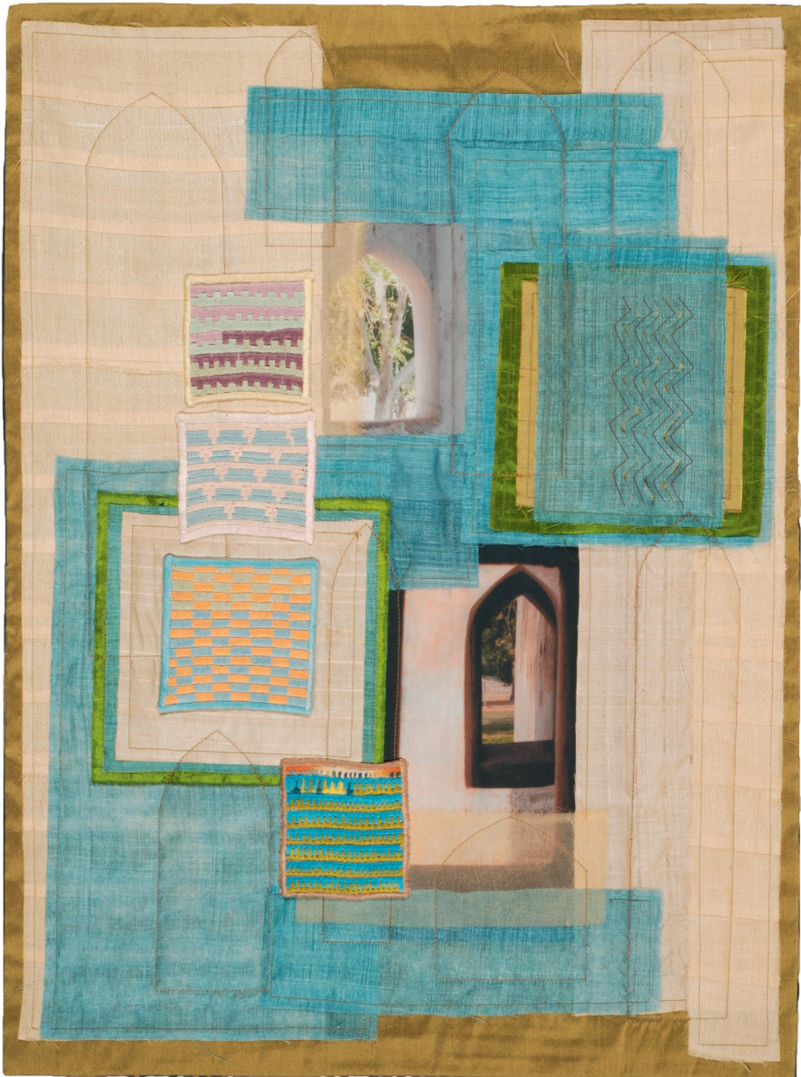
Figure 9. Molly Bullick, UK, Windows to the World , 60 cm x45 cm (24 in. x 17 in.) photo transfer, machine sewing and quilting