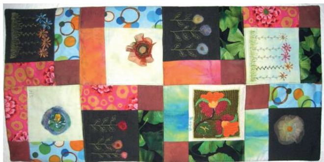
Figure 8. Sample works using embroidered Afghan squares: bag by Anne Bouissiere from France (top) and small patchwork wall hanging by Heidrun Siegler from Germany