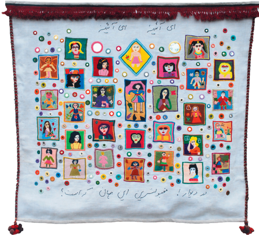
Figure 12. This wall hanging by Hella Prinzhausen from Germany features some of the very first (self-) portraits stitched by the Afghan embroiderers. Cotton, mixed media and embroidery

encouraged by Goldenberg and her colleagues (Figure 12). According to Parker: