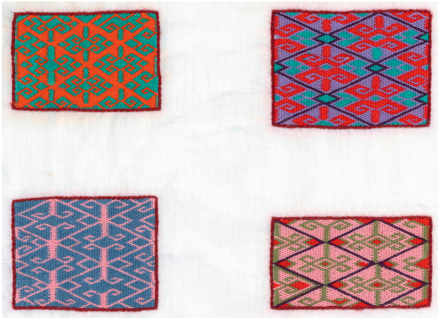
Figure 3. Hazara embroidery with silk thread by Golafirus from Shahrak in Afghanistan. Individual pieces are approximately 4 cm x 6 cm (1.5 in. x 2.5 in.) or 12.5 cm x 6.5 cm (5 in. x 2.6 in.)

They then return a few days later and complete the embroidery in Goldenberg's presence to prove that it is truly their own work. With the successful applicants, Goldenberg agrees to an official employment contract which highlights the need for high quality embroidery. Translators are, of course, present at all stages of this process and support Goldenberg. The number of squares a woman is contracted to deliver per quarter varies. Besides the quality of the work and its popularity on the European market, social factors are also considered. Women who have to support many children are allowed to deliver more squares than, for example, young unmarried girls. 30 However, Goldenberg also always makes sure to employ a significant number of unmarried girls between the ages of 12 and 20, in an attempt to revive this dying craft. 31 Currently, the project in Laghmani has contracts with about 200 women and a second programme founded in 2009 in Shahrak, in west Afghanistan near Herat, employs 30 women from the ethnic