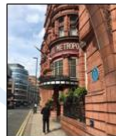
The Met Hotel, Leeds

To get your own copy of this newsletter contact the editors: