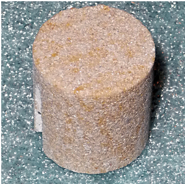
FIG. 1: NMR can determine the size of pores in materials, such as this sandstone core, by analyzing the diffusion of water inside the pores.

Where magnetic resonance imaging is limited is in resolving structural details on the micron or nanometer scale, a capability that would be desirable for simulating the flow of oil, water, and gas through porous rocks. The main limitation is often signal to noise. To have