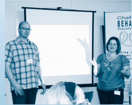
A training workshop

The CBF is offering free Challenging Behaviour workshops. The workshops are for professionals and families, and they are hosted in schools.