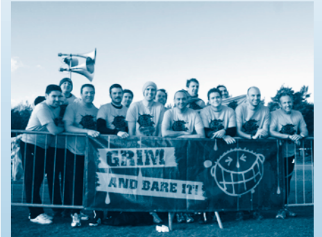
A fundraising team

When we launched our 15k for 15 years campaign at the end of last year, we called on our supporters to hold events to raise money for the CBF. The response was overwhelming. So far, we have reached £13,513, which is 90% of our total. Just as importantly, this money has come from over 240 individual donations. This really has been a mass fundraising movement.