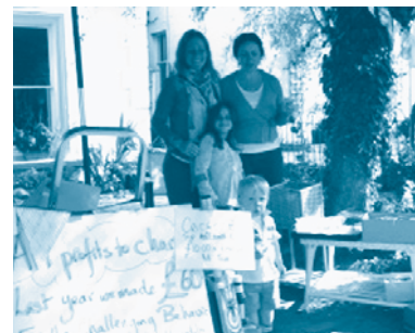
The tabletop sale