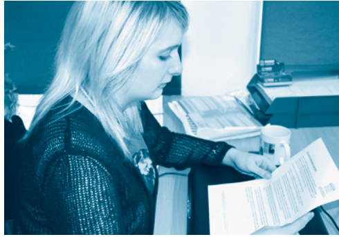
One of the summary information sheets

Fourteen of The Challenging Behaviour Foundation's full information sheets have been summarised, so it is now much quicker and simpler to find key facts about challenging behaviour and severe learning disabilities.