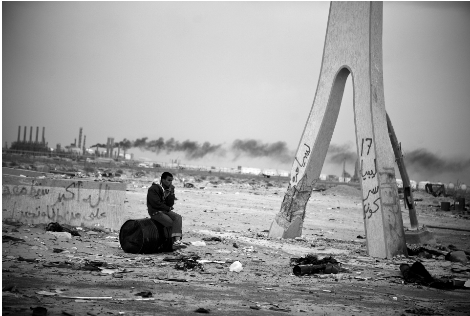
Figure 5: A revolutionary and a refinery confront the fallout. Ra's Lanuf, 2011.

Ironically (or perhaps not) one consequence of what the 'refugee crisis' has been a strong resurgence of support for the supposedly outdated and discarded judicial and political institutions of fascism. 146 This is not, however, the connection between 'colonial' and 'free' Libya that I want to draw attention to. The more salient connection, I suggest concerns the hierarchical position that contemporary Libya continues to occupy, not just in spite of but because of the formal egalitarian of the international community into which it has just been so violently (re)integrated. The rationale behind that violence and that hierarchy are clear: if competitive 'free' and 'equal' individuality within a 'sovereign' state really is the 'birthright of every man, woman and child', 147 then Libya's ongoing 'failure' as a sovereign state can only stem, 148 not from the intervention itself, but rather from Libyans' failure to manifest the maturity and rationality that are deemed necessary to 'reject violence, uphold equality, and...play by the rules of democracy'. 149 This is indeed the message which Libya and Libyans have been receiving from the 'international community' as the civil war continues. At a summit in mid-2015, for example, France, Germany, Italy, Spain, the UK and the US urged 'all Libyan decision makers to show in this crucial moment [the] responsibility, leadership and courage' necessary to sign the Skhirat Agreement, then in the process of being drafted by the UN's (Italian)