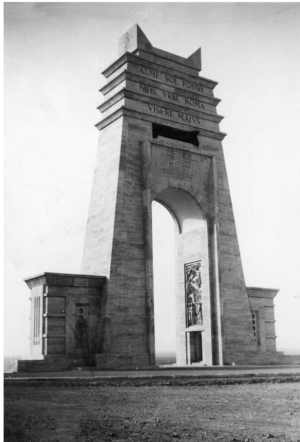
Figure 2: The Arco dei Fileni. Nazi propaganda image, 1937 © Photo: Sueddeutsche Zeitung/Alamy Stock Photo.

The form of the Arch, then, aimed clearly at underscoring Italy's claim to these territories through the enactment of a fold in the linear sequence of centuries to bring Libya's periods of classical and fascist rule together. But the memorial effect of this temporally twofold imperial international order was to obscure another one: that of the Islamic dar al-Islam to which, from the seventh century CE until 1912, Tripolitania, Cyrenaica and Fezzan had been assimilated. In effect, the concept of mediterraneità , as expressed in the Arch, wiped out nearly 400 years of Ottoman rule and thirteen centuries of Islamic political and territorial authority in Libya. 44 In doing so, it gave material form to fascism's colonisation not only of the area traversed by these territories, but of their past as well.