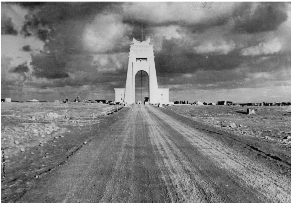
Figure 1: The Arco dei Fileni and the Via litoranea libica. Nazi propaganda image, 23 Sep. 1940.

Government of National Salvation); the rival House of Representatives which fled to Tobruk in mid-2014 after members of the original GNC rejected the results of the June 2014 elections; and the Government of National Accord established in December 2015 under the UN-brokered 'Skhirat Agreement', now also based in Tripoli. 11 For example, Hafta's LNA is (generally) supported by the House of Representatives – in theory (not in practice) the legislative arm of the GNA. Many of these militias also have external backing. For instance, in September 2016, Dignity forces seized back control of the refinery from the PFG supported by Egyptian and UAE airstrikes, 12 and Russia is liaising with Haftar directly, 13 in spite the latter's vociferous opposition to the Skhirat Agreement. 14 The US has been launching regular airstrikes in Libya against 'IS militants' since August 2016. 15 In the midst of this confusion of conflicting jurisdictional claims and aerial bombardment, it is difficult to confirm whether the bumps in the tarmac left by the remnants of the Arch are still visible.