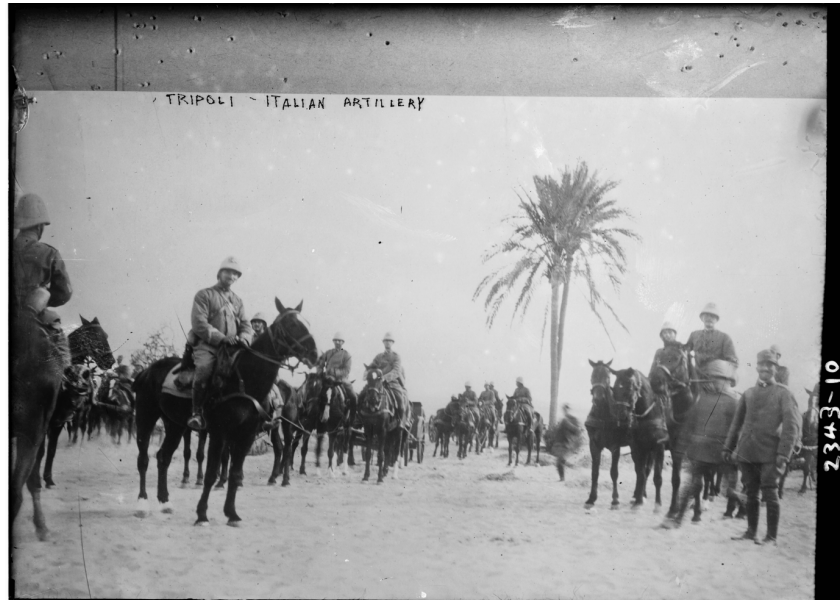
Figure 3: Italian artillery in Tripoli during the Italo-Ottoman War, 1911-12.

legend of a lost Roman road said once to have linked Sicily with Tripolitania. 74 In Libya, Italians would be able to ‘farm their own property, on the soil of the Motherland’, where ‘[t]he laws they voted for will safeguard them’. In this way, ‘Libya’ was cast as an amputated limb whose legal reattachment would bring about the unification of the ‘motherland’.