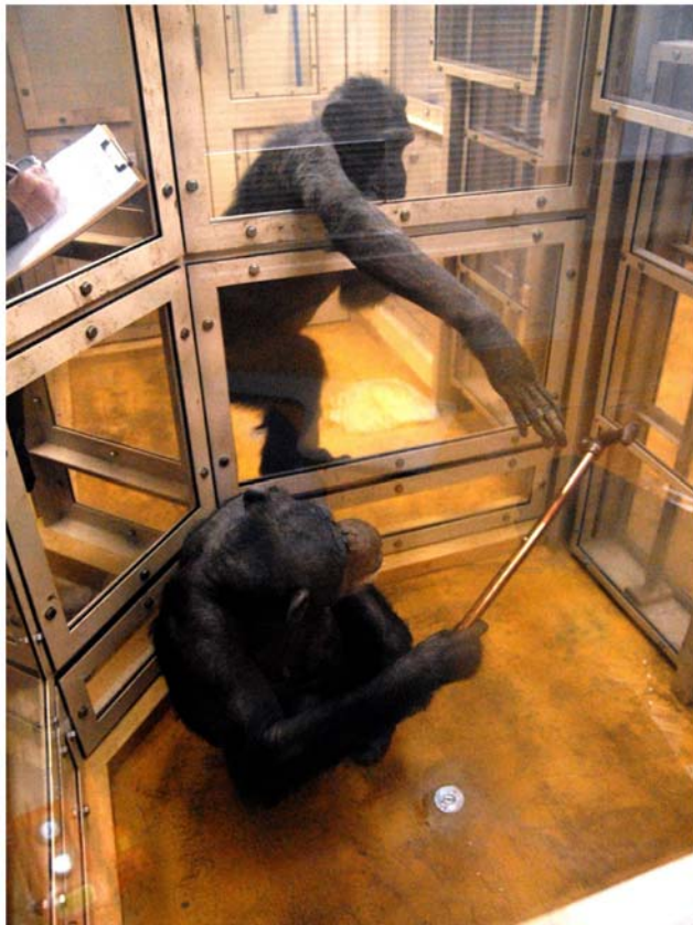
Figure 2. Tool transfer upon recipient's request. A chimpanzee (Mari) in the near-side booth picks up a stick and hands it over to her partner (Pendesa) in the far-side booth who requested the tool by poking her arm through the hole between the booths. doi:10.1371/journal.pone.0007416.g002

Observation of partner's struggle to obtain the juice without the use of a tool (only observed in the stick tool situation) did not elicit voluntary tool transfer. Stick possessors observed the partner reach out for a juice container without a stick in 47 trials, and of these 47 trials, voluntary transfer occurred 7 (14.9%) times; in other words, at a similar rate as that recorded overall (14.7%) (Chi-square test: \chi^2(1)=0.001 , p=0.97 ). Since no participant tried to obtain the juice without a tool in the straw-use situation, we could not conduct this analysis for straw transfer.