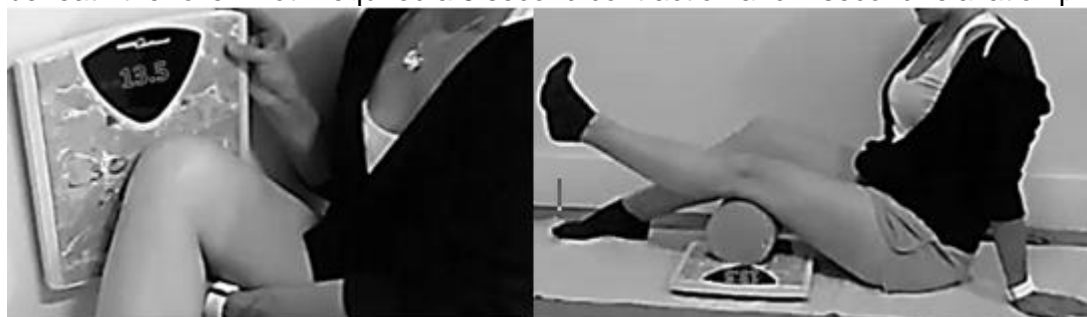
Figure3. Seated clamshell and short-arc quadriceps exercise.

extend the leg through the shortened range, registering contraction force on the scales beneath the roller. Both required a 5 second contraction and 2 second relaxation phase.