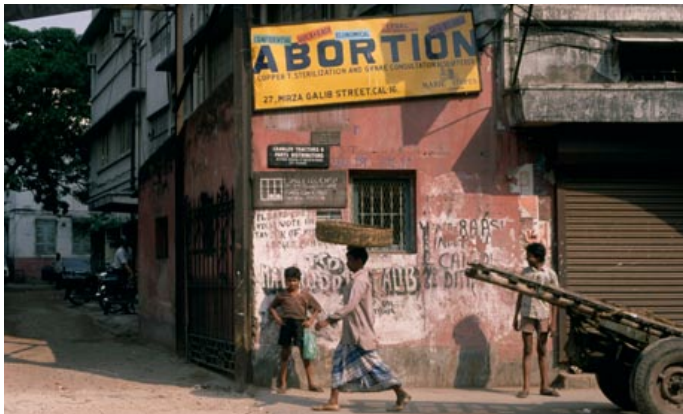
An abortion sign in Calcutta, India, where sex-selective abortions are common.

guardian.co.uk, Tuesday 28 February 2012 13.47 GMT