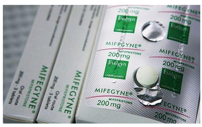
The abortion drug mifepristone.

guardian.co.uk, Thursday 22 March 2012 15.46 GMT