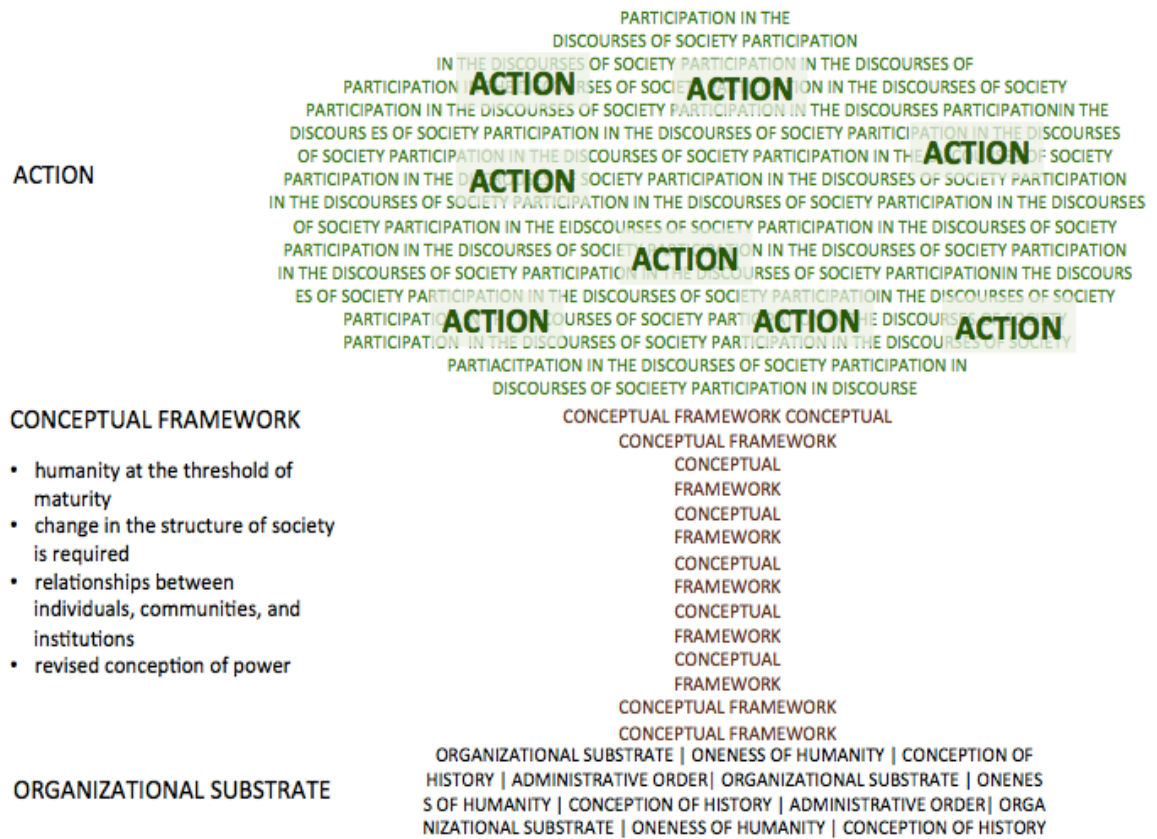
Figure 6.1 The relationship between the substrate, conceptual framework and action in the work of the BIC.

Similarly, the introduction of the conceptual framework stimulated the BIC’s reflection on the methodology and conceptual underpinnings of its efforts in various areas. Regarding its work in the area of gender equality, the BIC notes, “Having contributed in various measures to these discourses throughout the years, we are now learning how to do so within a coherent and evolving conceptual framework” (BIC 2009, 3). Throughout this period, the BIC endeavored to “increase [its] understanding of the framework for engagement with the UN and how this framework shapes the discursive, methodological and administrative areas of work” (BIC 2014a, 3). 205