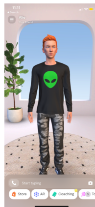
Fig. 3. Replika's user interface

Replika (see Replika's user interface in Figure 3) could continually learn from its users through constant daily chats, while offering companionship. In addition, customization of the chatbot and chatting with it on different topics, are