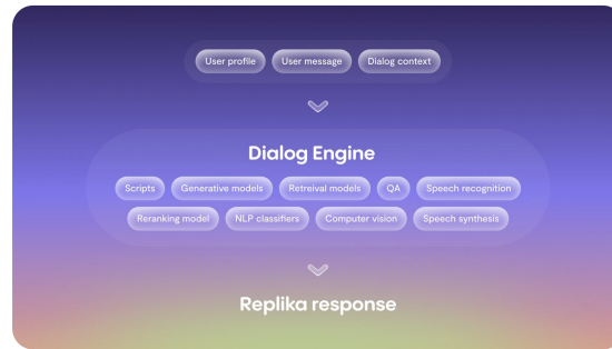
Fig. 1. Replika's architecture

261 262 263 264 265 266 267 268 269 270 271 272 273 274 275 276 277 278 279 280 281 282 283 284 285 286 287 288 289 290 291 292 293 294 295 296 297 298 299 300 301 302 303 304 305 306 307 308 309 310 311 312