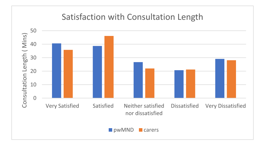
Fig. 2. PwMND and carer satisfaction with the delivery of diagnosis against the duration of consultation.

\leq 0.005). PwMND and caregiver ratings of the neurologists' abilities/ skills increased as the duration of the diagnostic consultation increased (see Fig. 1) as did their satisfaction with the delivery of the diagnosis (see Fig. 2).