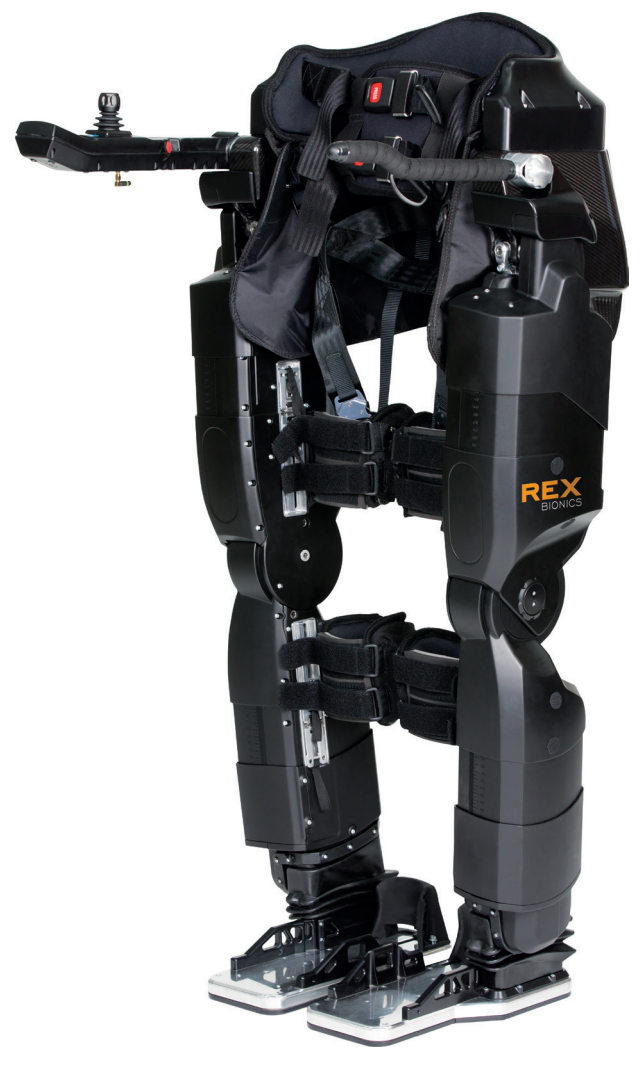
Fig. 2. Rex Rehab exoskeleton device seen from the side.

Individuals transferred into the Rex Rehab exoskeleton device with the appropriate level of assistance as risk assessed by the trial team. Optimal postural alignment and positioning of the individual within the device was ensured by the trial neuro-physiotherapist. Following a verbal briefing, the clinician then switched on the device and used the joystick to bring the individual up from a sitting to standing position. From the standing position, the appropriate functionality mode was selected (e.g. move forward). The device was then operated via "hands on" assistance from the trial neuro-physiotherapist, which enabled the participant to relax their arms and concentrate on their posture. The trial neuro-physiotherapist always held onto the Rex Rehab exoskeleton device to stabilize it when