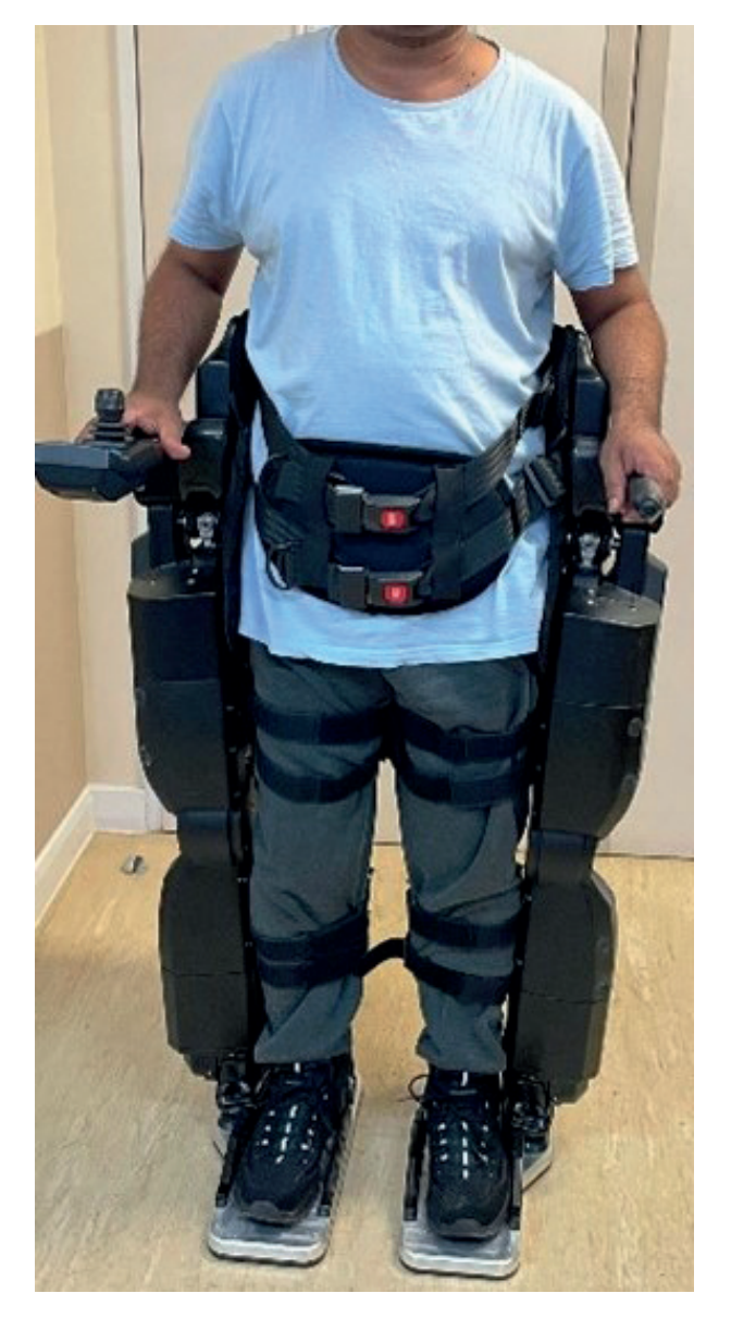
Fig. 3. Individual user inside the Rex robotic Exoskeleton Device from the front. An upright posture, with optimal alignment of the hips, knees and ankles in standing is supported by the device. The user can rest their hands on the bars at the sides. Velcro straps secure the user's legs, and an abdominal pad across the front is used to assist and support an upright posture. The joystick and controls are visible on one side.

measures were conducted using paired t-tests to examine changes in scores from pre-trial to post-trial time-points. The distribution of changes in scores was assessed visually and found to be approximately normally distributed for all outcomes. Where outcomes were measured on more than 2 occasions, 2-way analysis of variance (ANOVA) was used to compare between time-points (with participant and time being the 2 factors). For the PIADS scale, measured once post-treatment, a 1-sample t-test was used to indicate whether the results varied significantly from zero, in relation to whether using the Rex Rehab exoskeleton