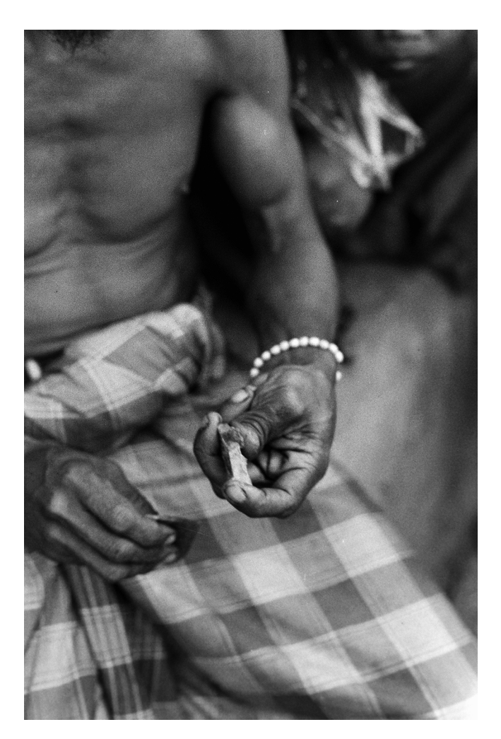
Figure 3. Hotena Neipani making fire using a chert kinonote strikea-light and iron, August 1975.

obvious, Nuaulu assume kinonote to be natural or sometimes supernatural objects. Archaic implements are considered further below as "repurposed" tools.