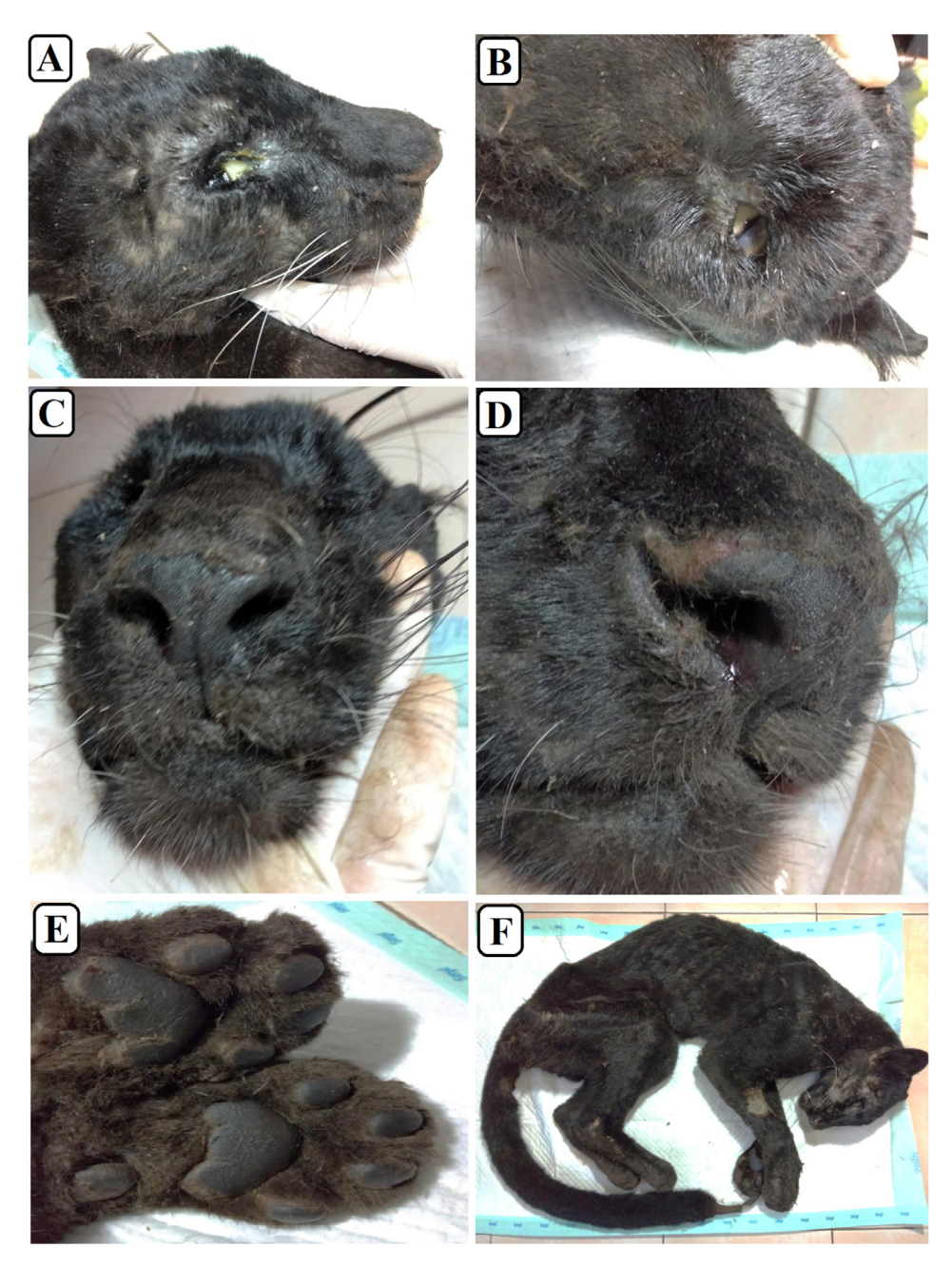
Figure 1. The Javan leopard 'Rita' post-mortem condition: (A) slight discharge from the right eye, (B) the left eye seems turbid, (C) dry nasal discharge around the nostrils, (D) slight bloody discharge in the right nostril, (E) hyperkeratosis on footpads-one of Canine Distemper's common symptoms-was found on all Rita's footpads, and (F) Rita's body condition after death.

the BioEdit program and aligned using NCBI Basic Local Alignment Search Tool (BLAST) program. The sequence was aligned with previously published CDV sequences deposited in GenBank using the ClustalW program. The accession numbers of all sequences are indicated in the taxon names. The evolutionary history was inferred using the Maximum Likelihood method based on the Tamura-Nei model [20] in the 1000 repetition bootstrap test. The construction and analysis of phylogenetic trees were carried out in MEGA7.0 [21].