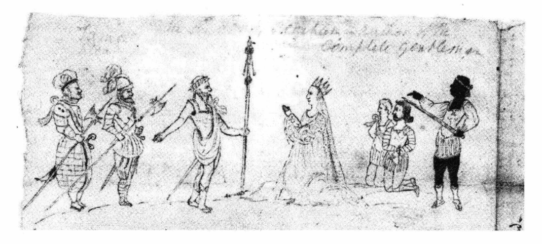
Figure 1: Detail from the Longleat manuscript's illustration of Titus Andronicus

Our Alexandrian revels. Antony Shall be brought drunken forth, and I shall see Some squeaking Cleopatra boy my greatness I'th' posture of a whore. (5.2.212-7)